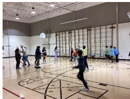
So happy to be back together!!!