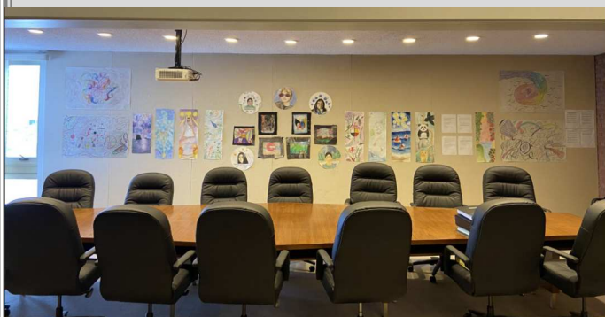
Sargent Park Student's art displayed in the Winnipeg School Division Board Office.