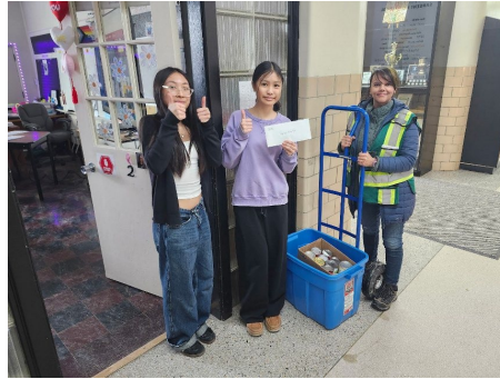
Harvest Manitoba Donation – Feb 2026