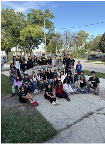
Student Council – Sept 2025