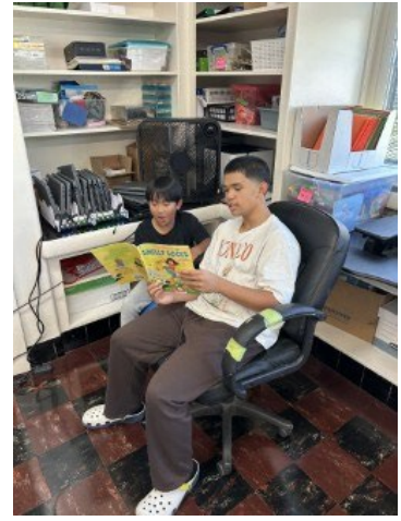
Learning Buddies – Oct 2025