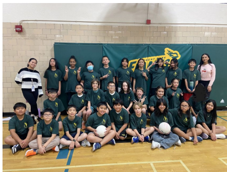
Gr. 5/6 Volleyball Tournament – Nov 2025