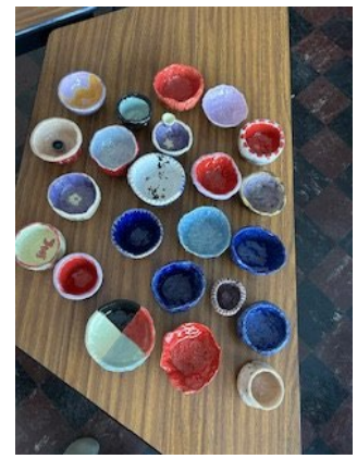
Smudge Bowls for Each Class – June 2026