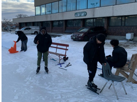
Speed Skating – Jan 2026