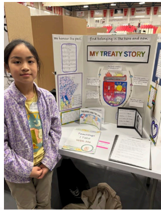
Inquiry Fair – April 2026