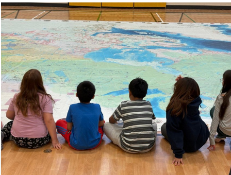
IPAC Map Project – March 2026