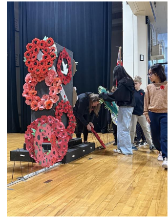
Remembrance Day Assembly – Nov 2025