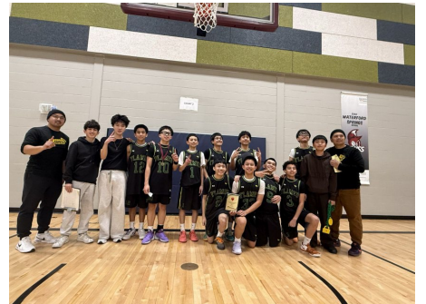
Tier 1 Boys' Basketball – Jan 2026