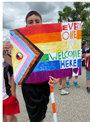
Pride Walk – June 2026