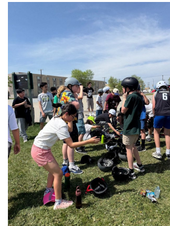
Sargent Park Skates – May 2026