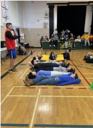
Gym Riot – Dec 2025