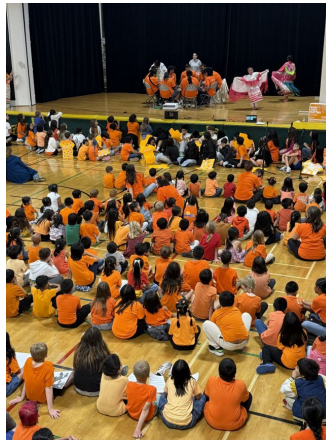
Every Child Matters Assembly – Sept 2025