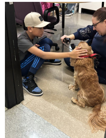
Therapy Dog Visits – Dec 2025