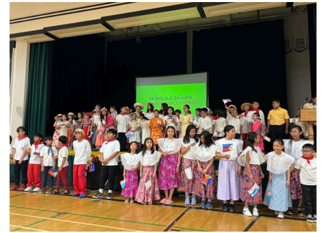
Filipino Heritage Program – June 2026