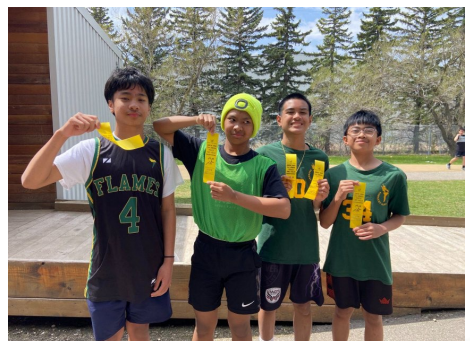
WSD Track Meet – May 2026