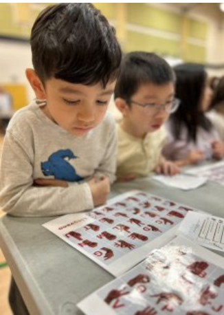
AAC Awareness Day – May 2026