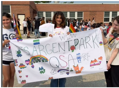
Sargent Park QSA