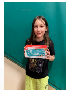
Chocolate Fundraising - Prize Winners