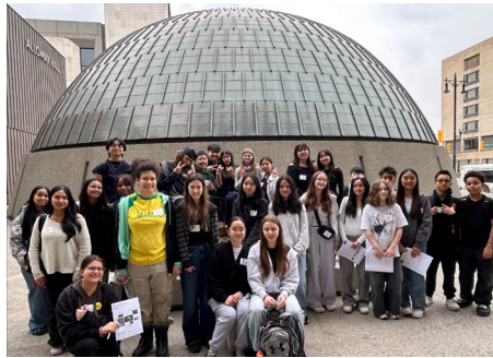
Historical Thinking Symposium