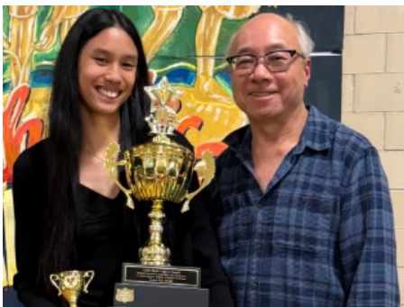
Colin Mark Legacy Award