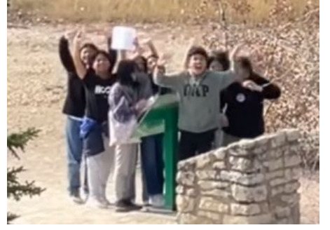
Stonewall Quarry Park