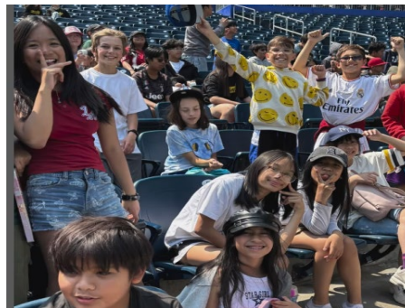
Valour FC Soccer Game