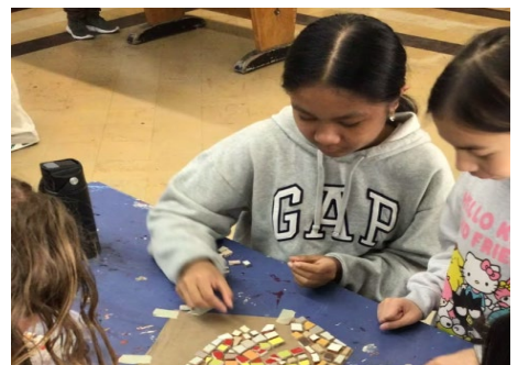
Mosaic Tile Project