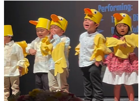
Filipino Heritage Program