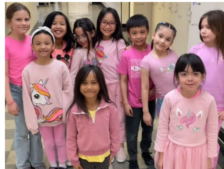
International Day of Pink