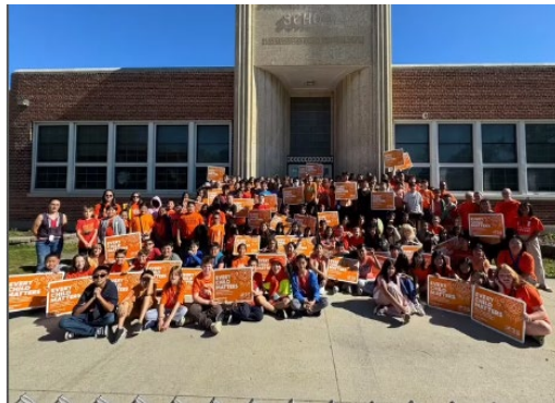
National Day of Truth & Reconciliation