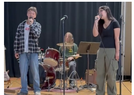
Celebration of the Arts