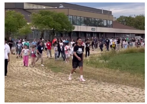
Terry Fox Run