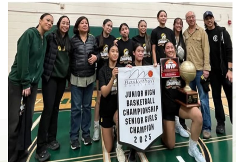
Gr. 9 Girls Basketball Provincial Champs