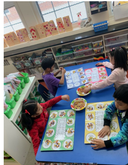
100 th Day of School Activities