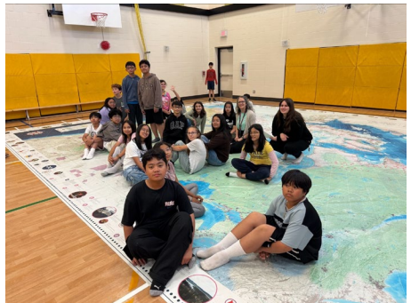
Indigenous Peoples Atlas of Canada