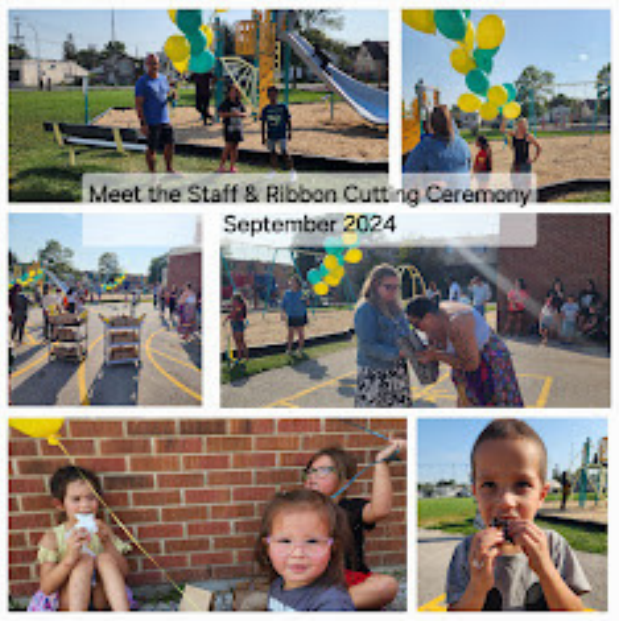
Meet the Staff & Ribbon Cutting Ceremony September 2024