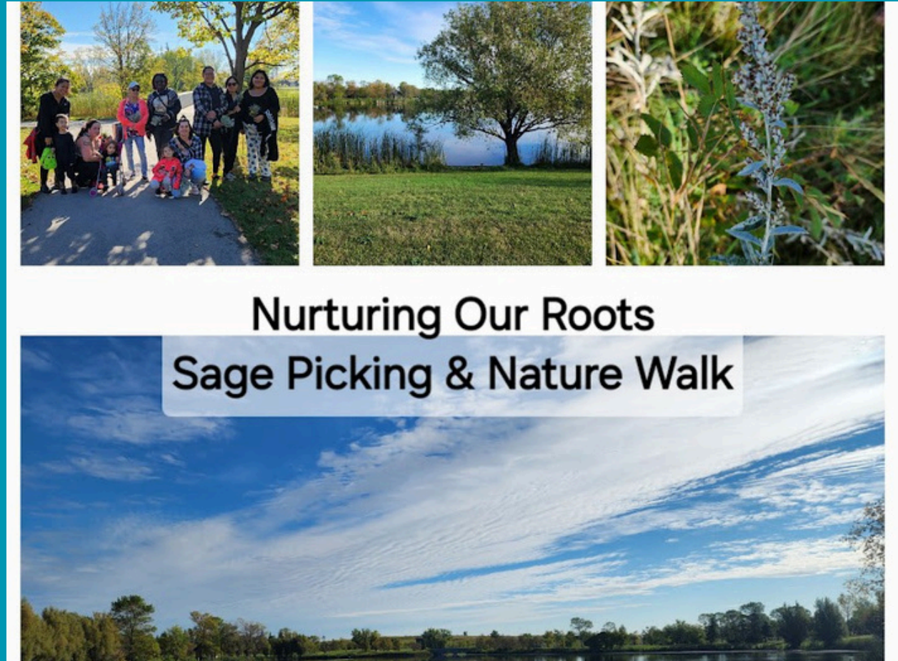
Nurturing Our Roots Sage Picking & Nature Walk