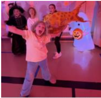
Spirit and smiles at the Halloween Dance