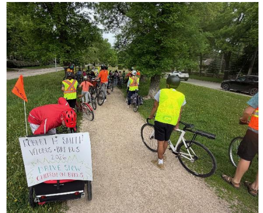
The Bike Bus!