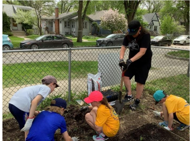
Planting a Three Sisters Garden

Students experienced increasingly authentic learning opportunities that promoted critical thinking, collaboration, creativity and student ownership of learning while supporting high expectations for every learner.