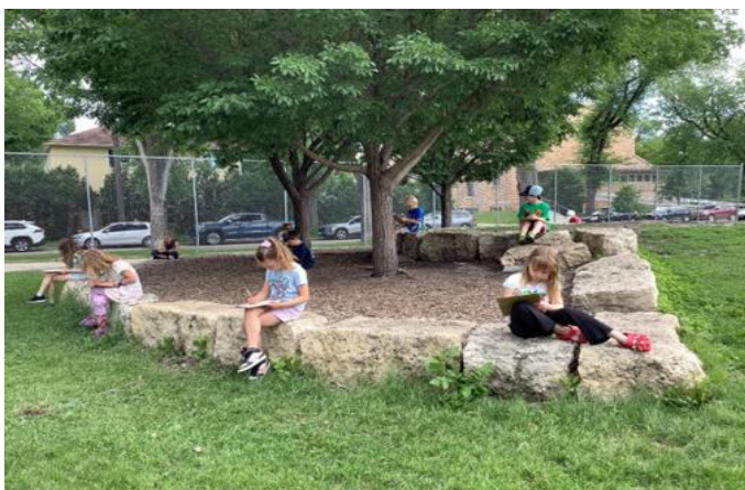
Art on the Hill