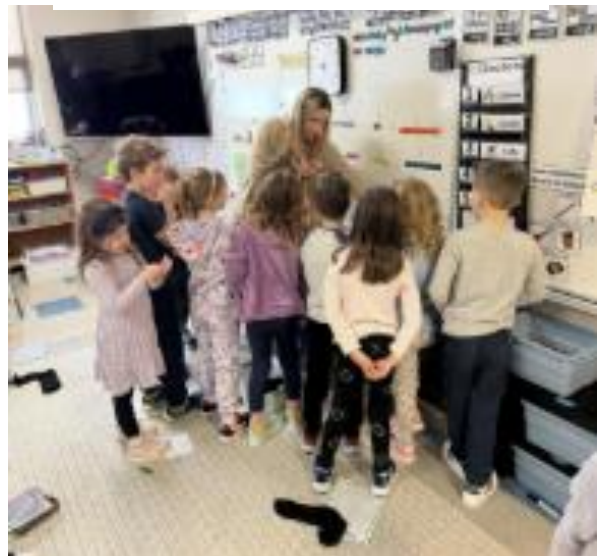
MathUp in French Immersion