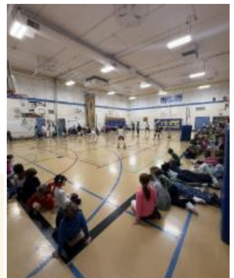
Cheering on the students-versus-staff volleyball game

Our Goal: Build strong partnerships between school, families and the community to support student success and strengthen belonging.