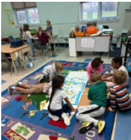
Collaboration in IDEAS