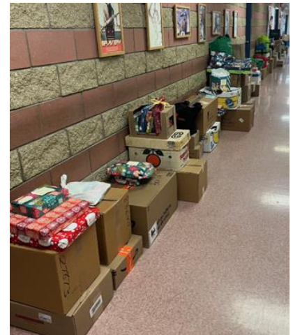
Holiday Hampers Ready for Delivery

Families continued to play an essential role in supporting student learning and school life. Together, we strengthened the sense of community that makes École Robert H. Smith School a welcoming place for every family.