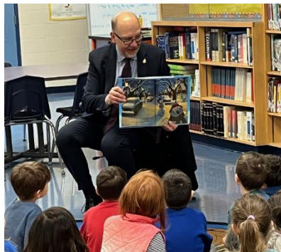
I Love to Read