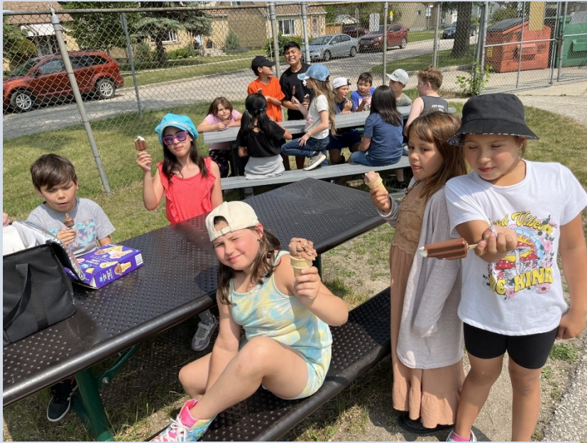
Math Groups celebrated outside!