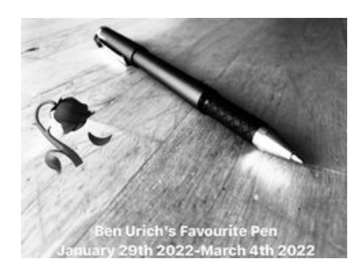
Ben Urich's Favourite Pen January 2022 - March 2022

In my life, I've known and used many pens varying in quality. Pen Urich was the best one I ever knew. I look back fondly on the times when I wrote the answers to questions in assignments with him and once filled out my school registration with him. I was in Period 4 math when it happened. I was in the middle of an assignment, writing with him when his ink started running out. I thought "No matter, It's probably something blocking the tip". It wasn't. I shook him a bit to see if that would change anything. It didn't. I took Pen apart to see how much ink was left in him. There wasn't any. Now is when I started to get desperate. I took him apart even more and attempted to swap out the ink cartridge. I took out every ink cartridge from every pen in my pencil case and tried, futilely, to swap