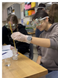
La précision de mesures est clé!