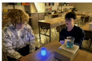
L'oxydation du luminol

"J'aimais beaucoup cette occasion d'avoir choisi ma propre expérience et de le faire en groupe! Il a augmenté ma compréhension globale des sujets qu'on est en train d'étudier au présent. C'était intéressant aussi de voir les expériences des autres groupes et leurs idées." - Emerald