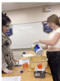
Le blanchissement du colorant