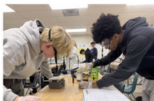
La décomposition de peroxyde

"J'ai pensé que c'était tellement super. J'ai aimé faire cette expérience, j'ai appris comment la théorie des collisions affecte la vitesse de réaction." - Andrei & Zinnia