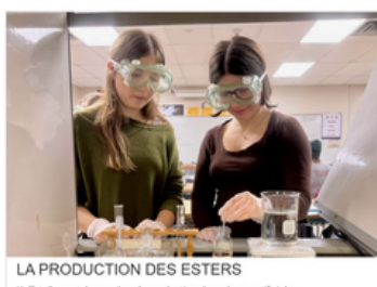
LA PRODUCTION DES ESTERS L'effet d'un catalyseur dans la production des odeurs artificielles

"J'ai eu un sens de liberté et un aperçu dans le monde de science au niveau postsecondaire. La méthode d'étudier différente a fonctionné mieux pour moi" -Will