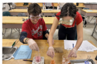
La température affecte la Vrxn