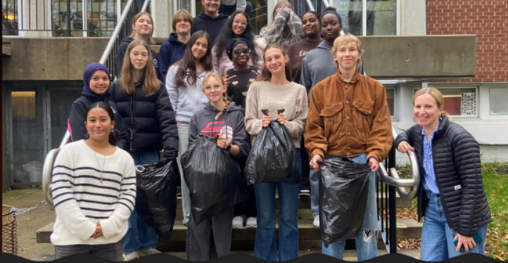
Thank you to our Youth in Philanthropy (YiP) crew who took time during their lunch hour to help clean up our community!