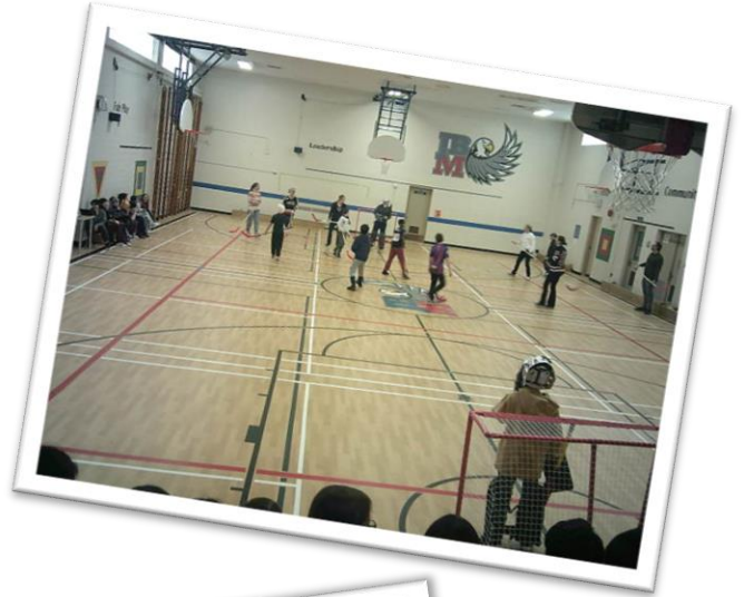
Hockey Sticks for Harvest

Thank you to our families, our many volunteers and to our JBM Parent Council for your generous gift of time and for your ongoing support.