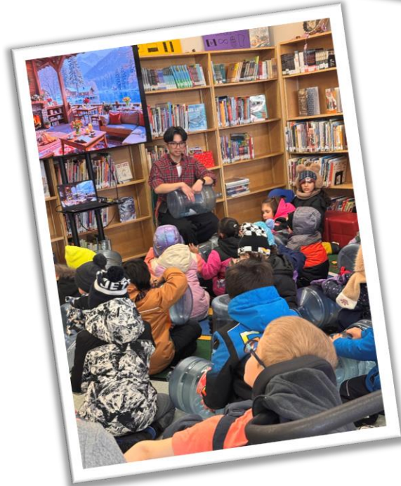
PAC Family Fun Night