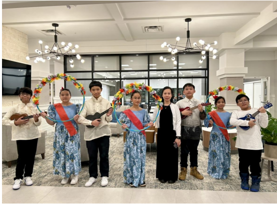
In September, students were again invited to participate in the Winnipeg Jets Fans Fest at the Hockey For All Centre, Portage Ave.

For those who are also interested, MAFTI is offering free Filipino-language classes for teens and adults, both online and in-person. We love and appreciate the unwavering support of parents and the passion of our students in these programs. It gives students and the community the chance to witness and experience the rich Filipino cultural heritage.