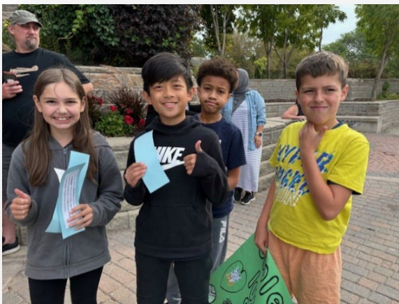
Luxton Students that spoke at the Peace Walk