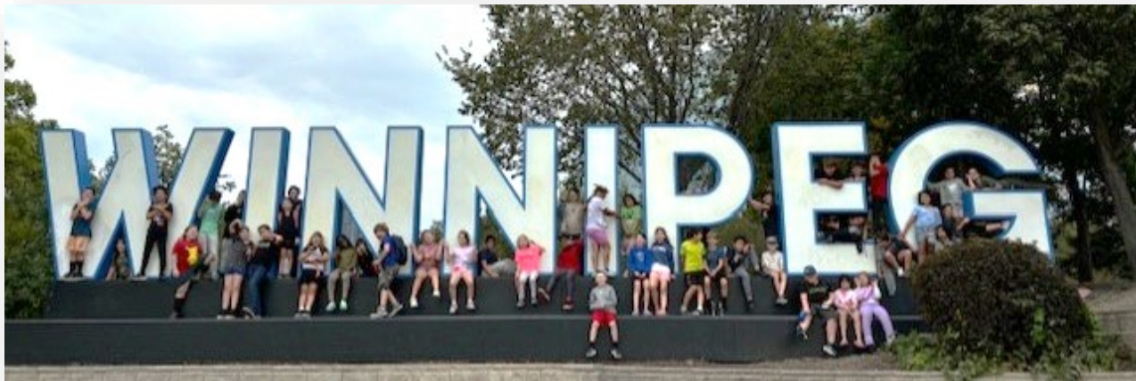
Students from Rooms 20, 25 & 26 attended the Peace Walk at the Forks

A big thank you to the students that volunteered to speak on behalf of our school by letting others know what peace meant to them.