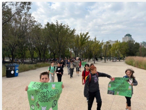
Part of the Peace Walk