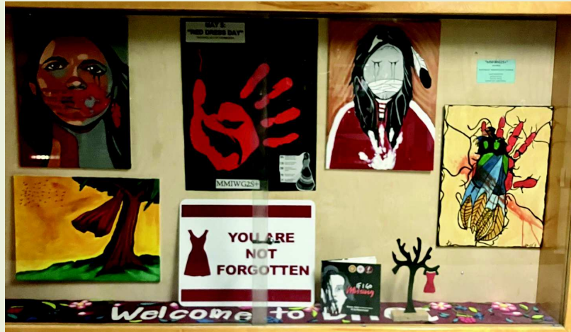
Red Dress Day Art Project