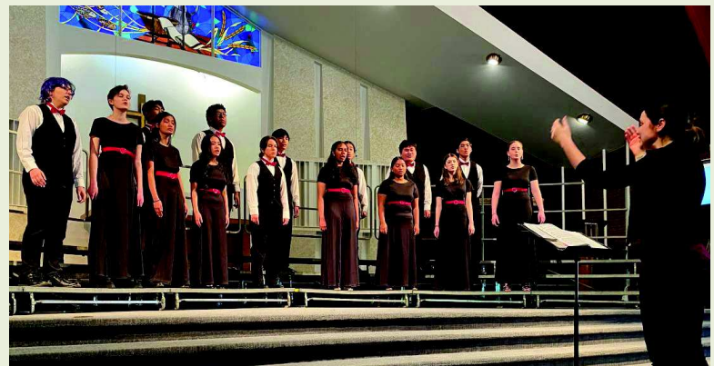
Winnipeg Music Festival