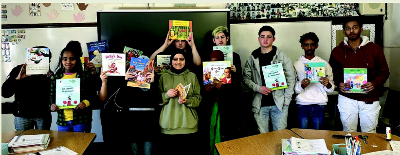
LAL Centre students reading bilingual books