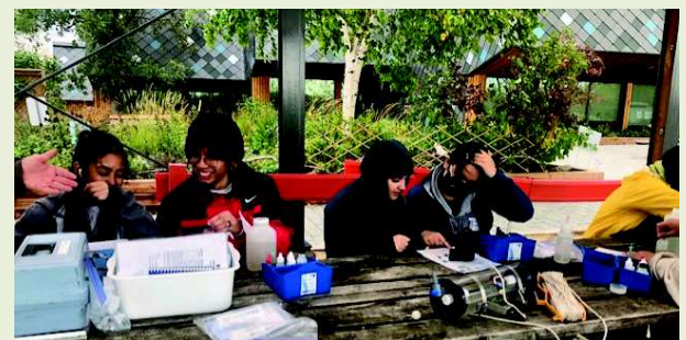
Freshwater Ecology Day