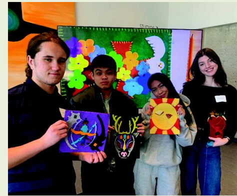
WSD Art Convention