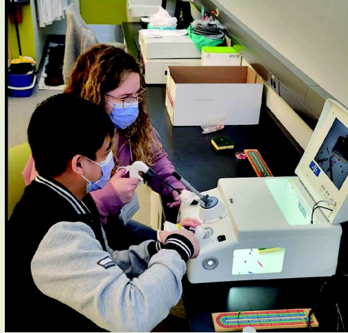
Medical Professionals Careers Program