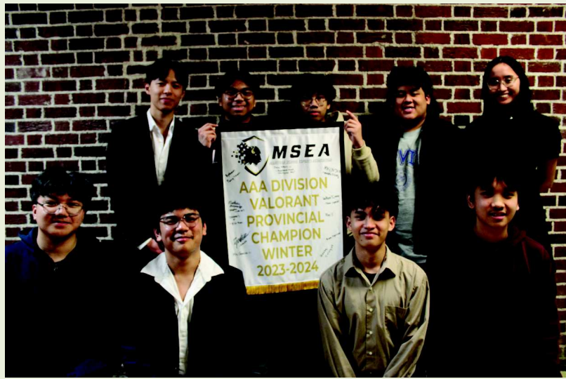
eSports Provincial Champions