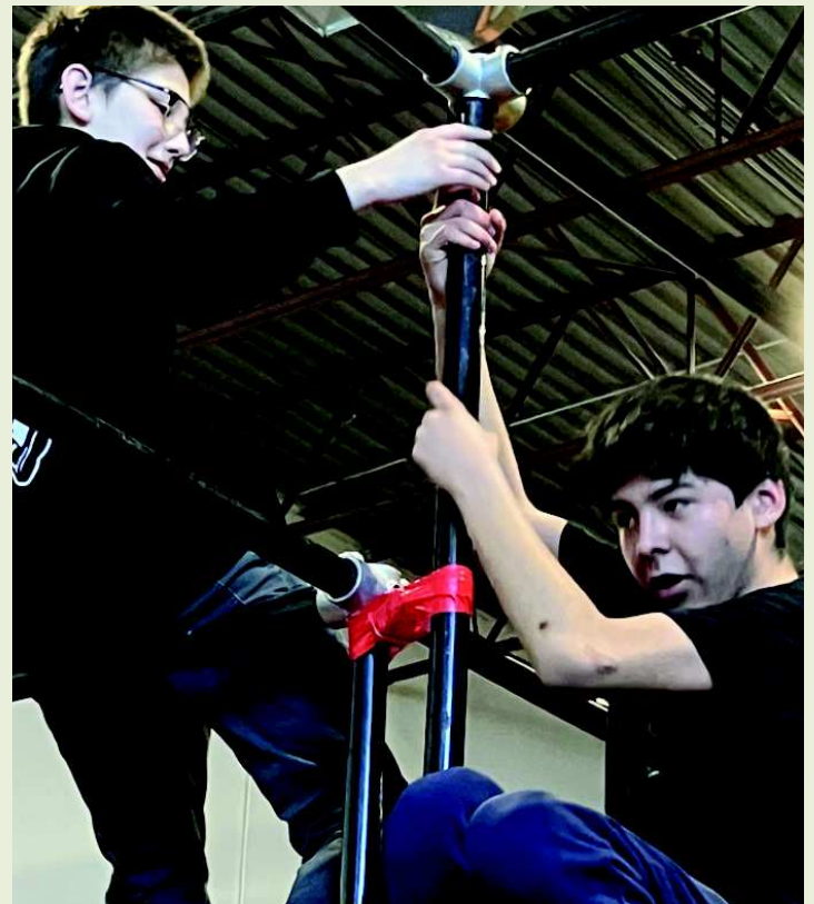
At Serratus Movement center

In March, students of Warrior’s Path “Ogichidaa Miikana” classroom explored the physical challenges of “parkour” at Serratus Movement Centre in the South End of Winnipeg. Students participated in a number of activities, such as scaling walls and monkey bars, jumping through staged windows, swinging from ropes, and rock climbing. Through physical trial and error, students had a great time being active in a unique facility.