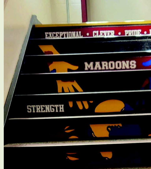
Staircase Graphic Design Project