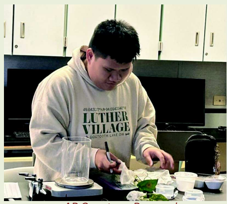
AP Capstone Research