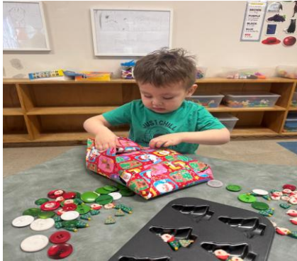
Machray Pajama Project