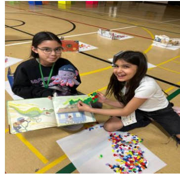
Traveling With Stories