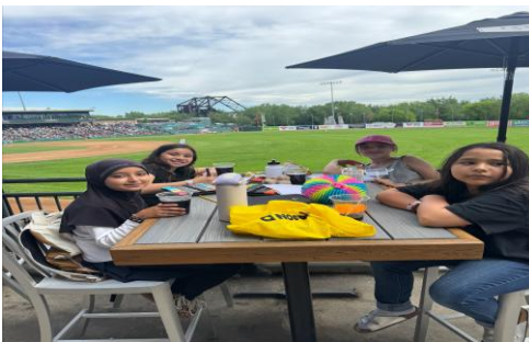
Goldeyes Game: Qualico