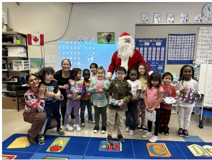
Machray Pajama Project