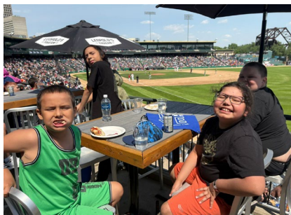
Goldeyes Game: Qualico