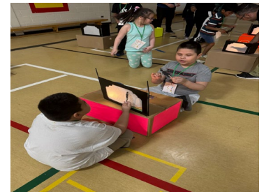
Traveling With Stories