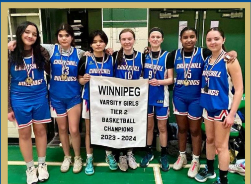
Mini Basketball Academy