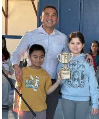
STEAM Award recipient Room 15