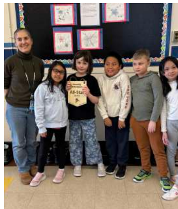
Attendance Award recipient Room 12