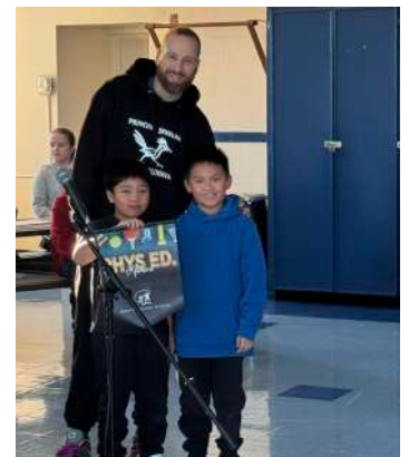
Gym Award recipient Room 8