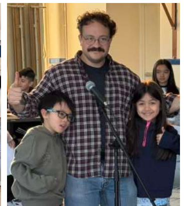
Music Award recipient Room 12