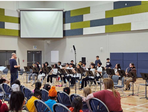
Our Gr 5-8 Spring Concert took place on May 18