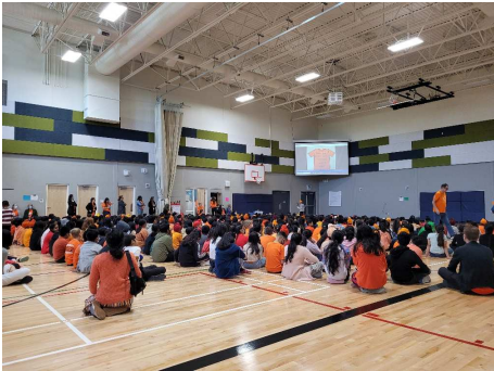
We honoured Truth & Reconciliation with an assembly in September