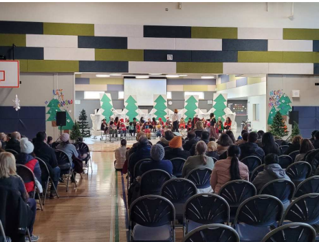
Our Winter Concert took place in December 2023