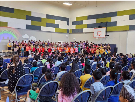
Our Gr 4-6 Spring Concert took place on May 17