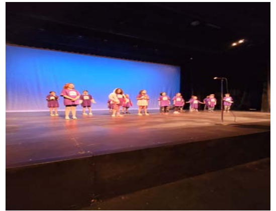
Music Equals: Musical Theatre