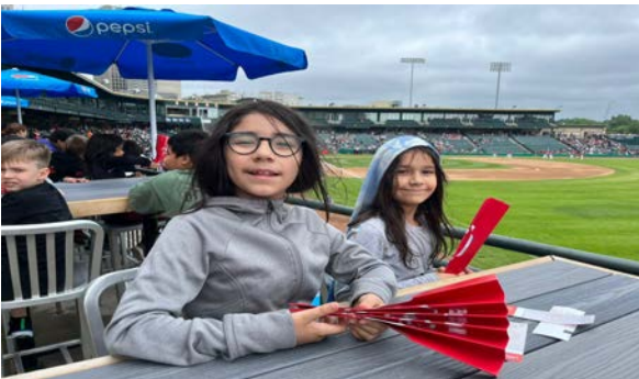
Goldeyes Game: Qualico