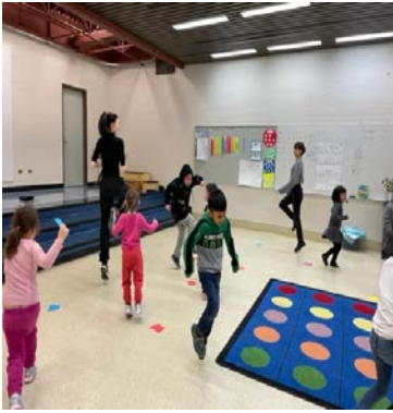
Sharing Dance: Winnipeg Ballet