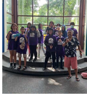
Music Equals: Ukulele