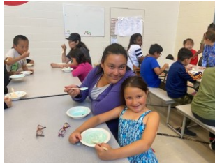
Ice Cream Read To Me Celebration