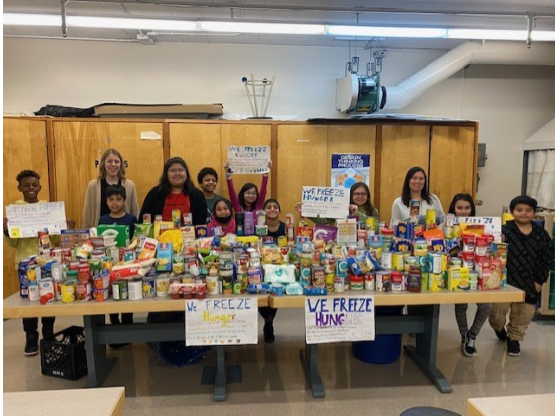
We Freeze Hunger Donation