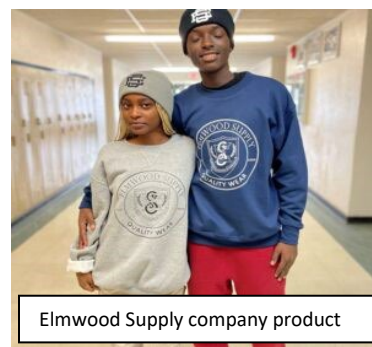
Elmwood Supply company product