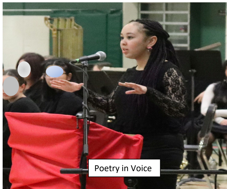
Poetry in Voice