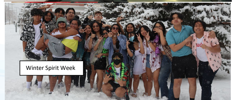
Winter Spirit Week