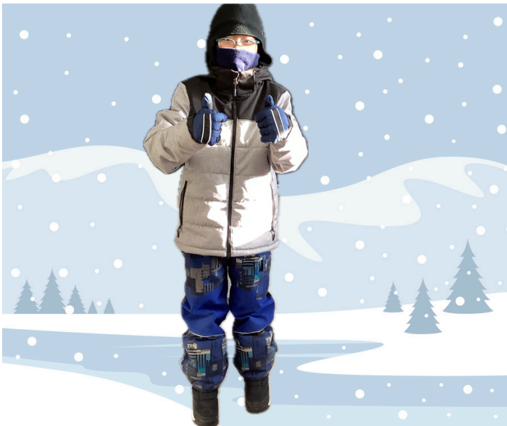
Two thumbs up for dressing for the cold!

You don't want to be a person-popsicle, so heed my warning and dress properly for the winter snow!