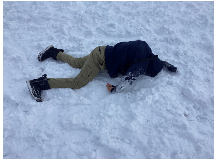
Dressing to be "cool" will get you so cool you're...COLD!

**No students were harmed in the making of these photos 😊