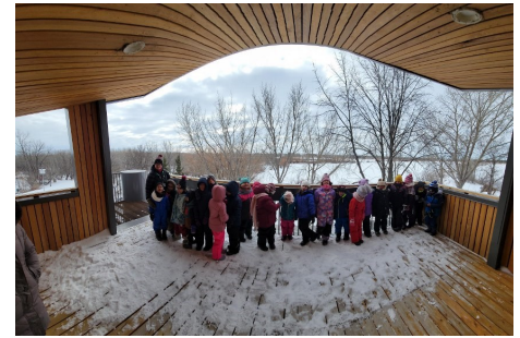
Grade 1 Field Trip to Fort Whyte