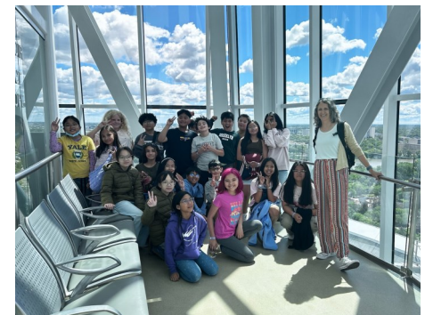
Grade 5 Field Trip to the Canadian Museum of Human Rights