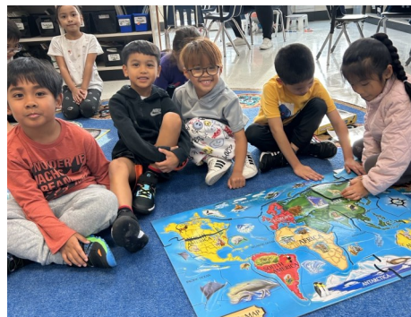
Grade 2 Students Learning About Our World