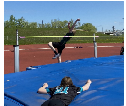
WSD Track & Field Meet