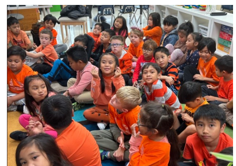
Orange Shirt Day Learning