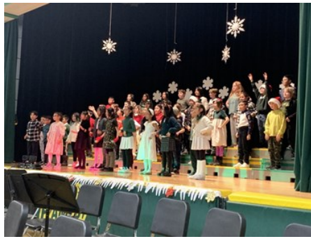
Nursery-Grade 6 Winter Concert Performance