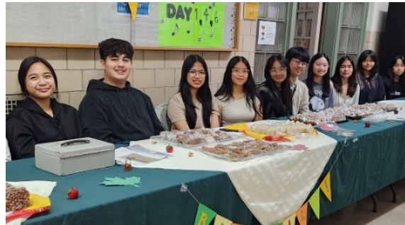
Community Bake Sale