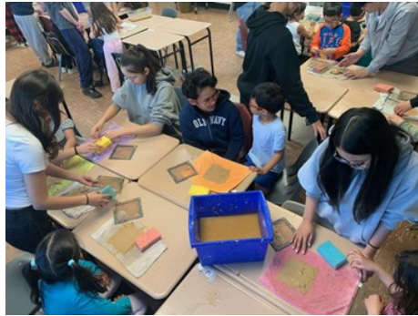
Artist in the School - Papermaking Project