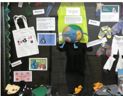
Fast Fashion Sock Drive