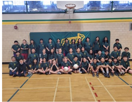
Grade 5/6 Volleyball Tournament