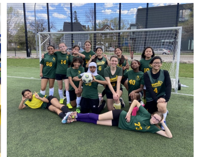
Grade 7-9 Girls Soccer Team