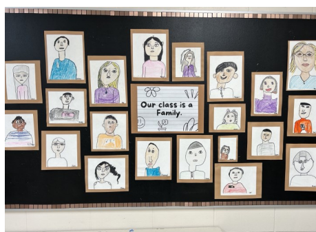
Grade 2 Family