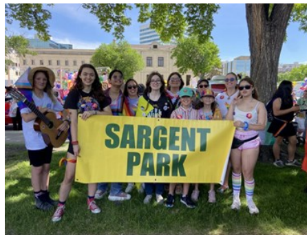
Pride Parade - June 2, 2024