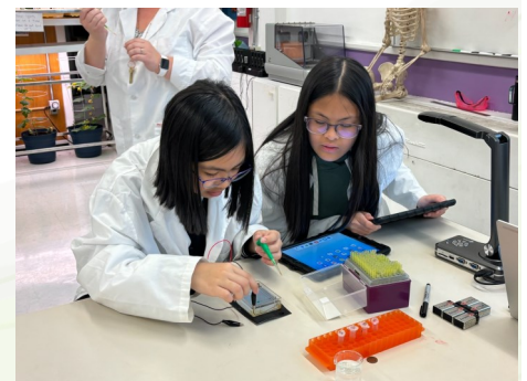
Grade 8 Students at Inner City Science Lab