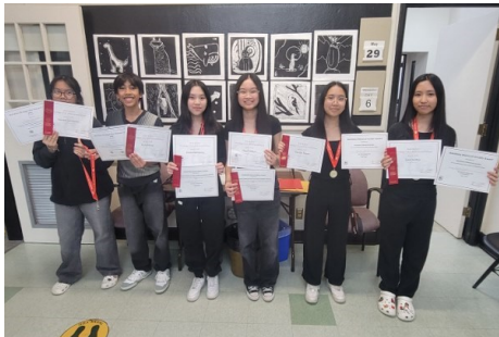
Red River Heritage Fair Award Winners