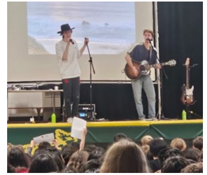
The Lockyer Boys Concert