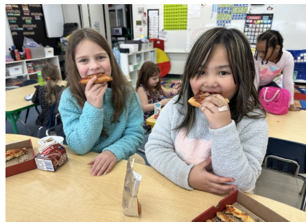
Fun Lunch - Boston Pizza