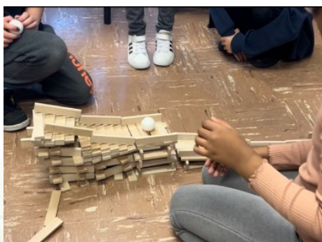
STEAM Project—Grade 3 Making Mazes