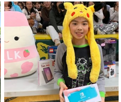
Chocolate Fundraiser Prize Winner