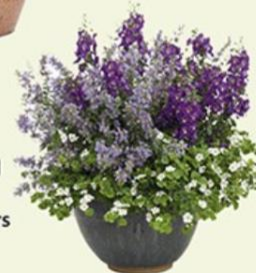
Mixed Sun Planters