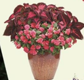
Mixed Shade Planters