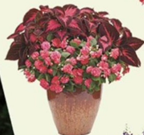
Mixed Shade Planters