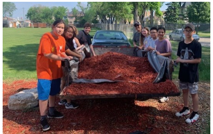
Working in our Turtle Garden