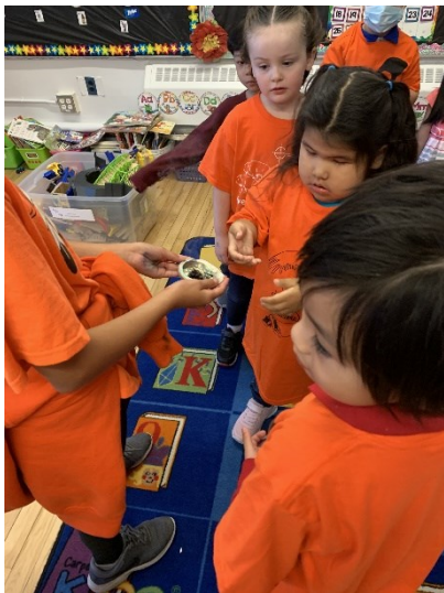
Smudging in class