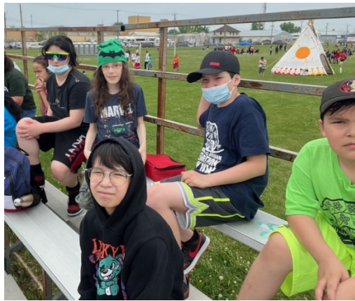
Annual Pow Wow Celebration

...to further develop initiatives and innovative approaches addressing individual student needs and accessibility requirements, mental health issues, childcare needs, and nutritional needs.