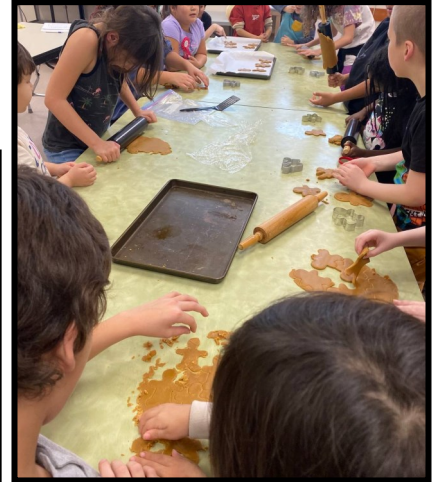
Room 34 and Room 4 Reading Buddies made Gingerbread