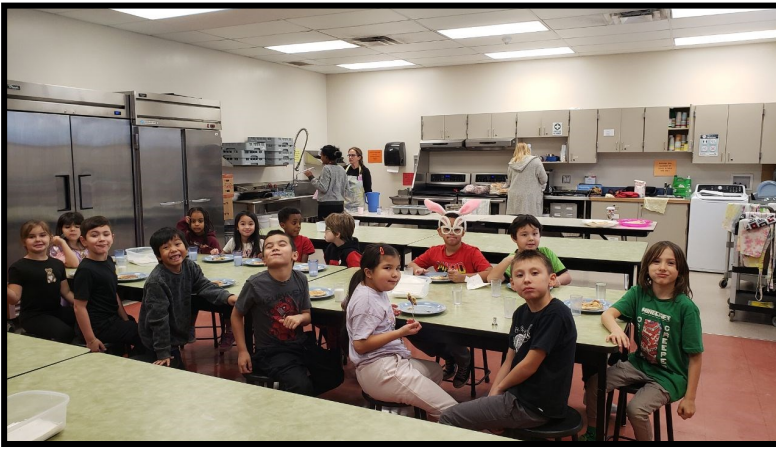
Room 8 celebrated learning with a waffle breakfast!