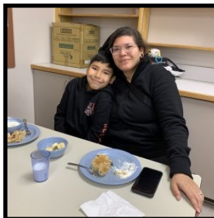
Lord Selkirk School community members enjoyed a Pancake Breakfast!