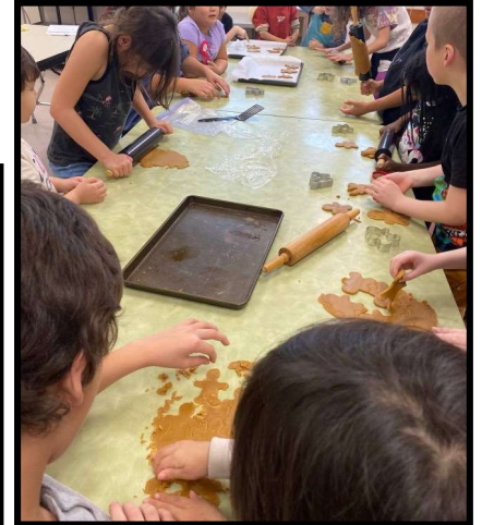
Room 34 and Room 4 Reading Buddies made Gingerbread