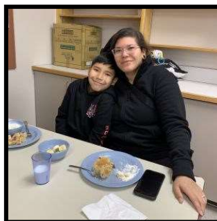
Lord Selkirk School community members enjoyed a Pancake Breakfast!