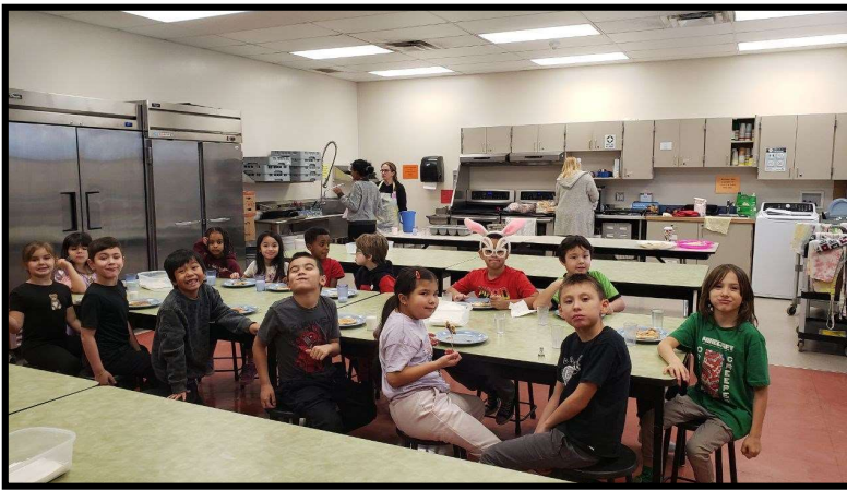
Room 8 celebrated learning with a waffle breakfast!