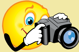
Photo retakes will take place on Thursday, November 17, 2022