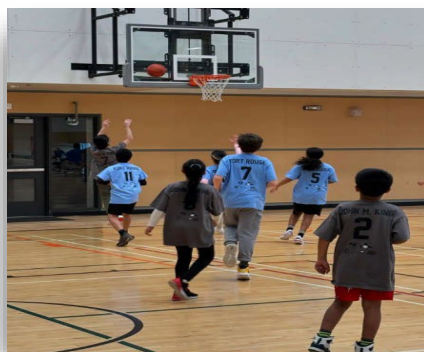
Inner City Basketball