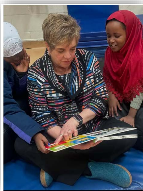
Pancakes, Picture Books & PJs