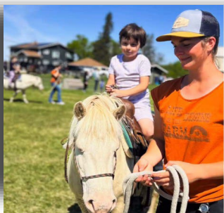
Family trip to the farm