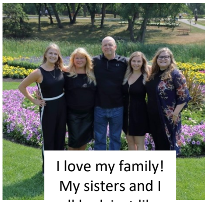
I love my family! My sisters and I all look just like our Mom.