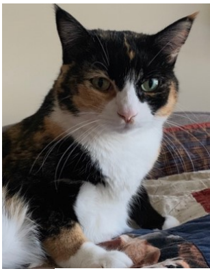
My cat's name is Cocoa!!!