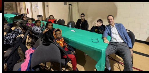
Pancake Breakfast/ Activity Day