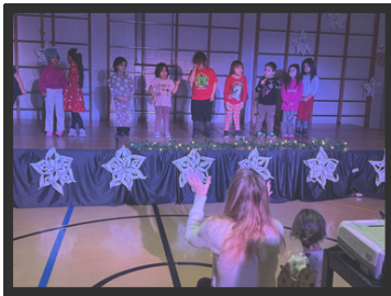
N/K Winter Concert