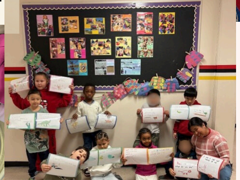
Room 18 has been creating books. They made books about Apples, Peace, Kwanzaa, and a book modeled after "Brown Bear, Brown Bear, What do you see?".