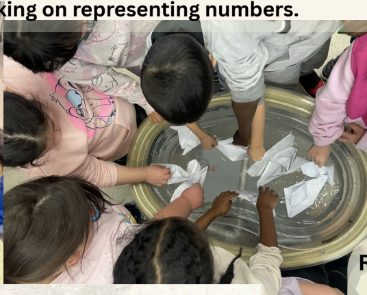
Room 16 has been exploring winter through building snow forts and snowmen inside and outside, and has been learning about solids, liquids, and gases, including making our own boats!