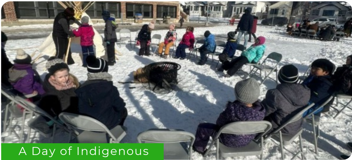
A Day of Indigenous Outdoor Learning

We are excited to invite you and your family to our 3 rd Annual Wahkotowin Day! This special Indigenous outdoor learning celebration brings our school community together to connect with nature and each other. Families are warmly welcomed to join us for a day filled with hands-on activities and meaningful experiences in the outdoors.