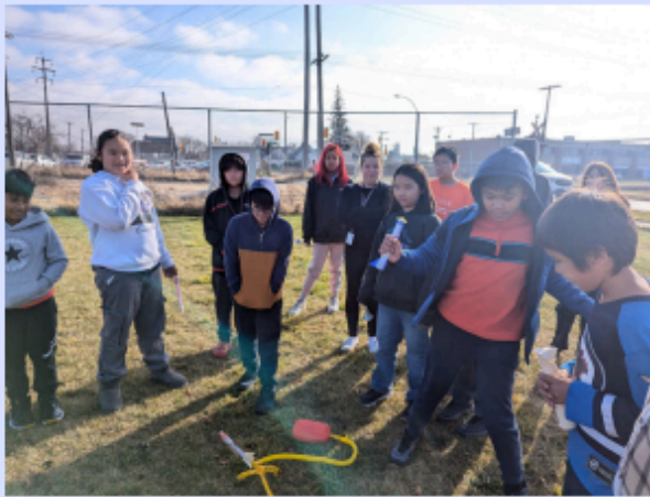
Room 12 testing our Air Rockets in November!