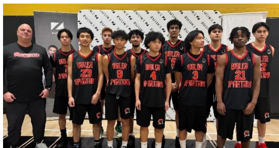
Sisler's Varsity Boys Basketball Team 2024-2025