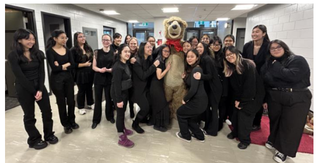
Members of Sisler's choir program with a new friend