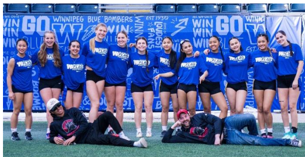
Sisler's Girls Flag Football Team 2024-2025