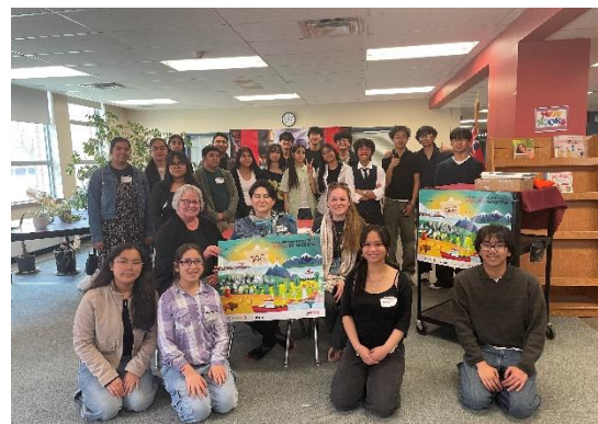
Student and staff organizers of Student Vote 2025