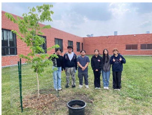
Sisler students planting trees on school grounds