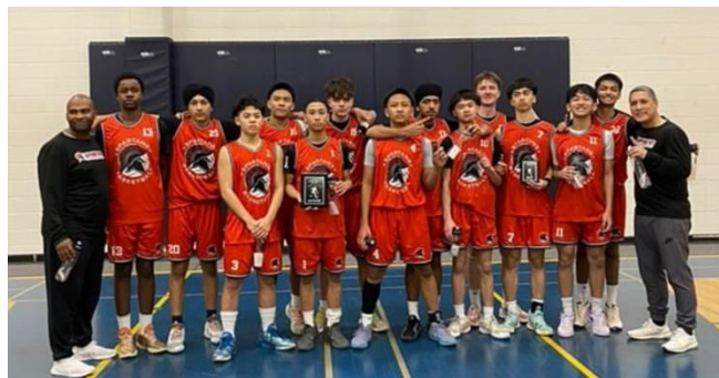
Sisler's JV Boys Basketball Team 2024-2025