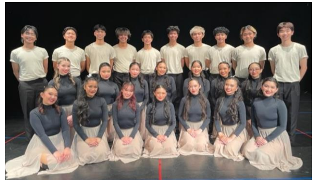
Sisler's Most Wanted Dance Team