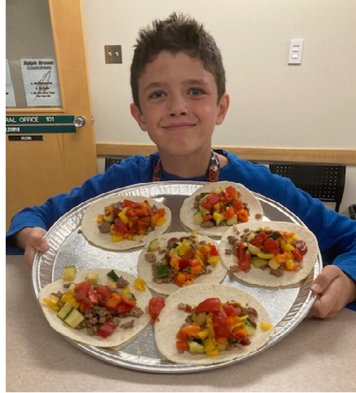
Room 107 students tried their hand at cooking and created fabulous fajitas.