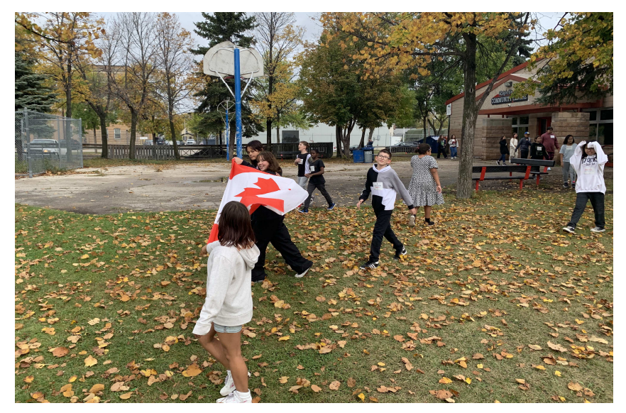
Students heading out for our Terry Fox Run, some carrying flags from across our country.