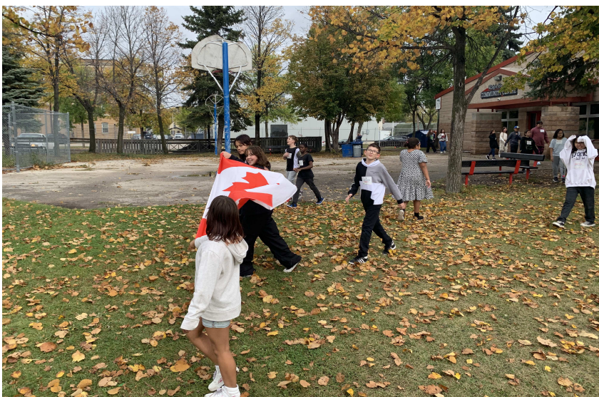
Students heading out for our Terry Fox Run , some carrying flags from across our country.