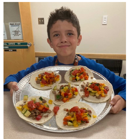
Room 107 students tried their hand at cooking and created fabulous fajitas.