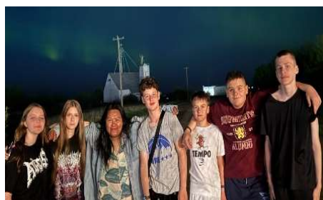
Gr. 8 students on the trip to Vegreville, AB were lucky enough to catch the Northern Lights display.