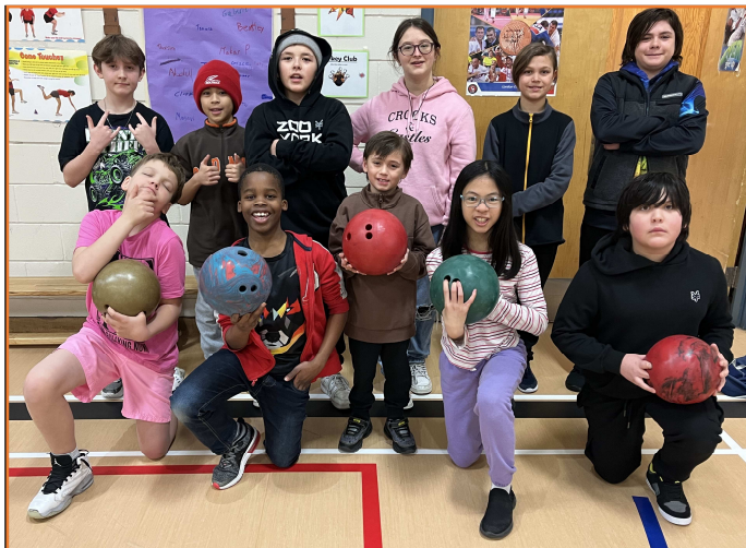
Pictured above are members of the prestigious “Turkey Club”; bowlers who got three strikes in a row. Thanks to MB Tenpin Federation for providing the equipment so all students had a chance to try their hand.