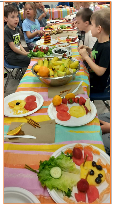
Students in P1 and P2 had opportunity to “play with their food”, creating colorful and delicious creations.