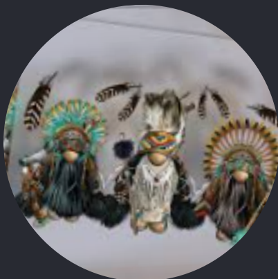
Direct to Film Printing