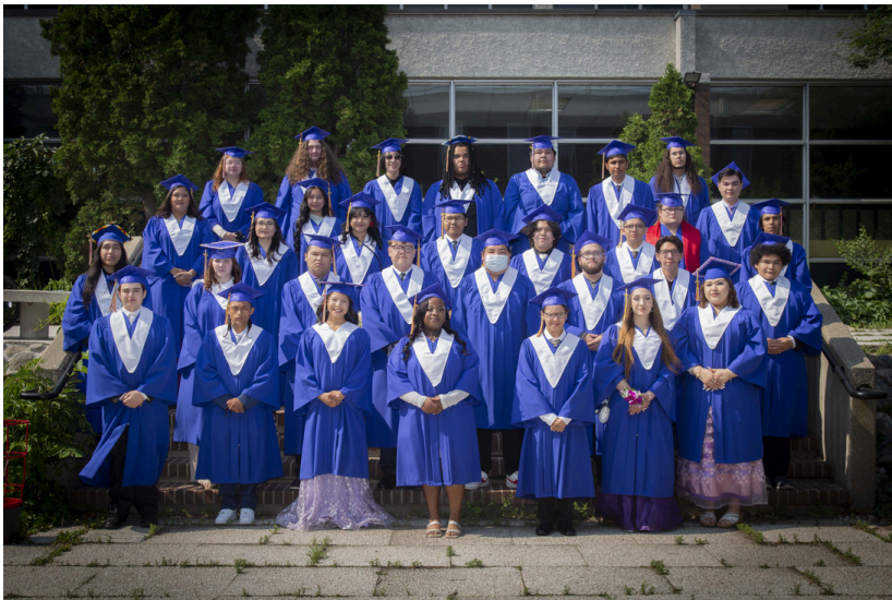
High School Graduates 2025