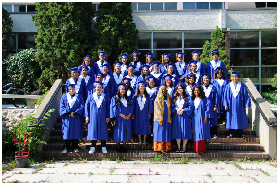
Pre-Industry Training Graduates 2025