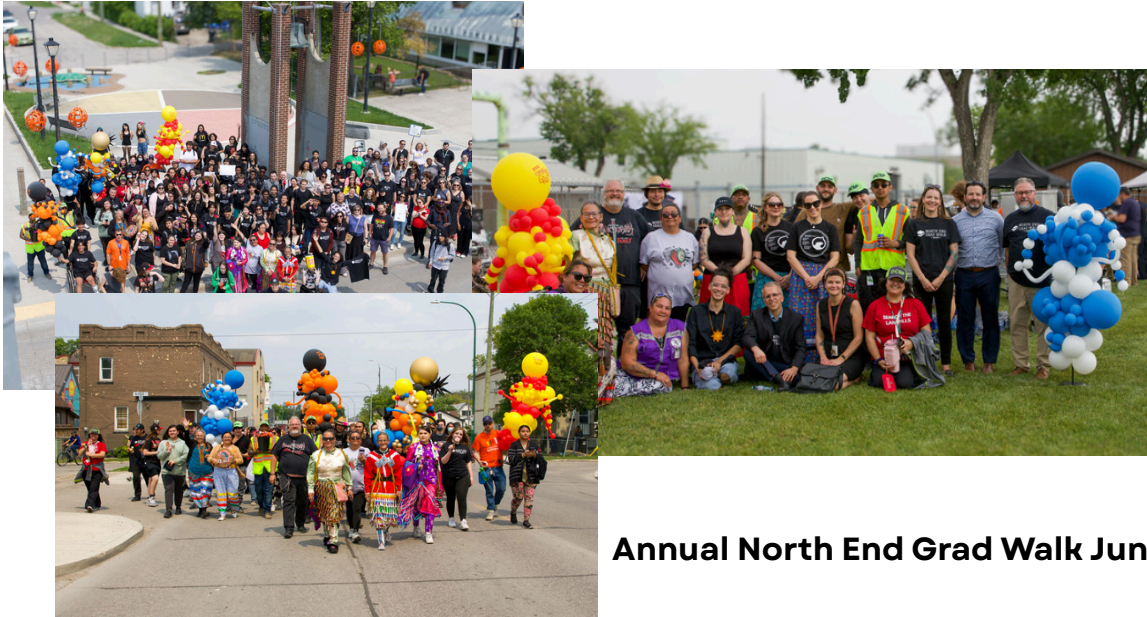
Annual North End Grad Walk June 12, 2025