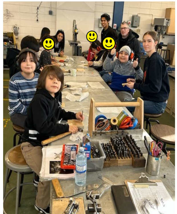
Room 305 making spoons in woods for their Metis Kitchen Party Winter Concert performance.