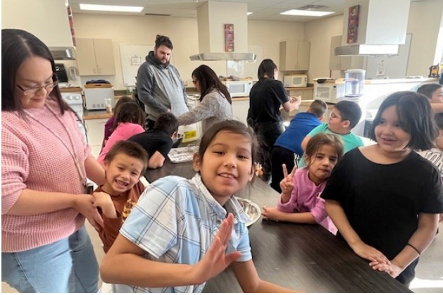
Rooms 114 & 115 making Bannock.