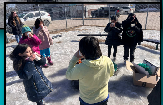
Students enjoying hot chocolate around the fire.