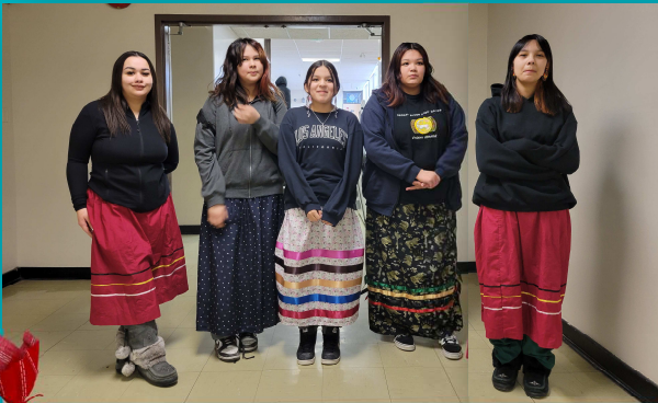
Students getting ready for the pipe ceremony

It was a very busy week filled with fun & learning!