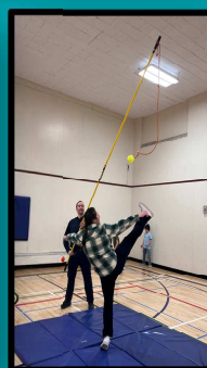
Indigenous games day activities