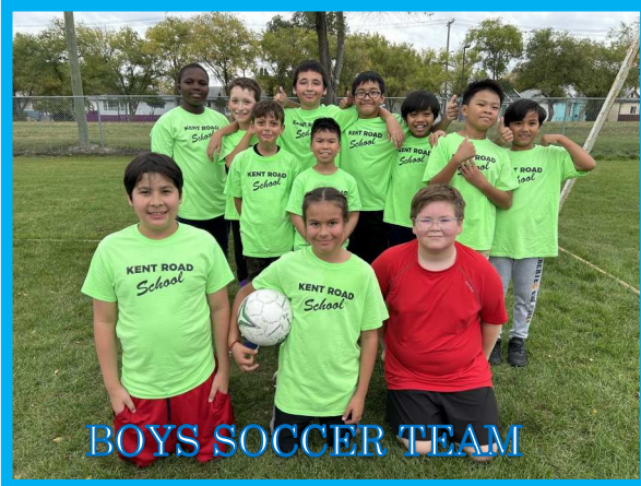
BOYS SOCCER TEAM