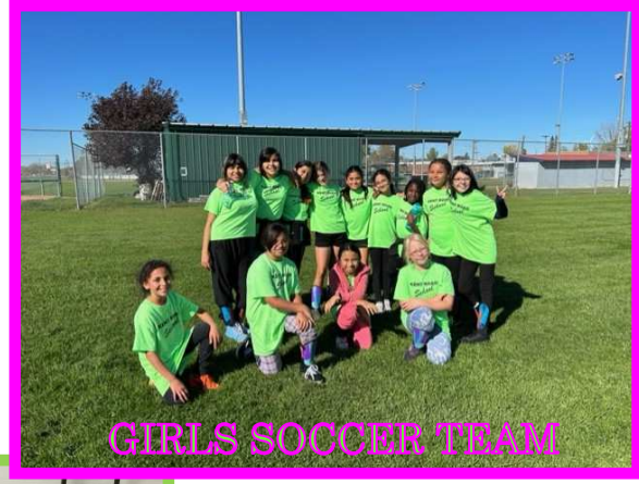
GIRLS SOCCER TEAM