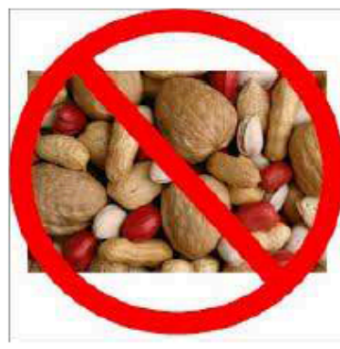
No Tree Nuts