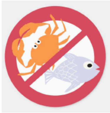
No Fish or Shellfish

Do not bring fish, shellfish, peanuts or nut products into Harrow School.