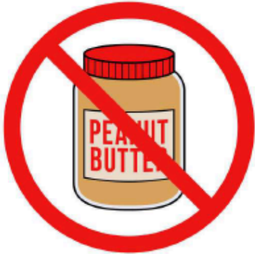
No Peanut Butter