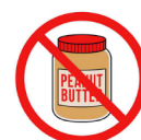
No Peanut Butter