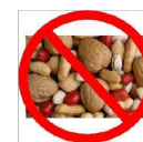
No Tree Nuts