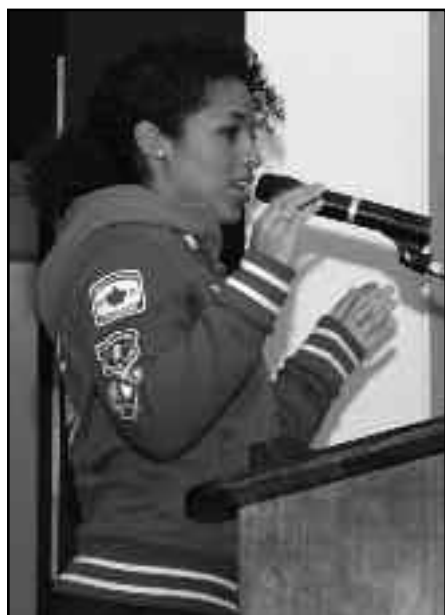
Manitoba Olympian and London 2012 bronze medalist soccer player Desiree Scott told students that setting reachable goals and having a positive mental attitude were keys to making healthy choices in life.

Grade 7 and 8 students from across the Division gathered at R.B. Russell Vocational High School for the Youth Wellness Conference, a special event co-sponsored with the Winnipeg Police Service.