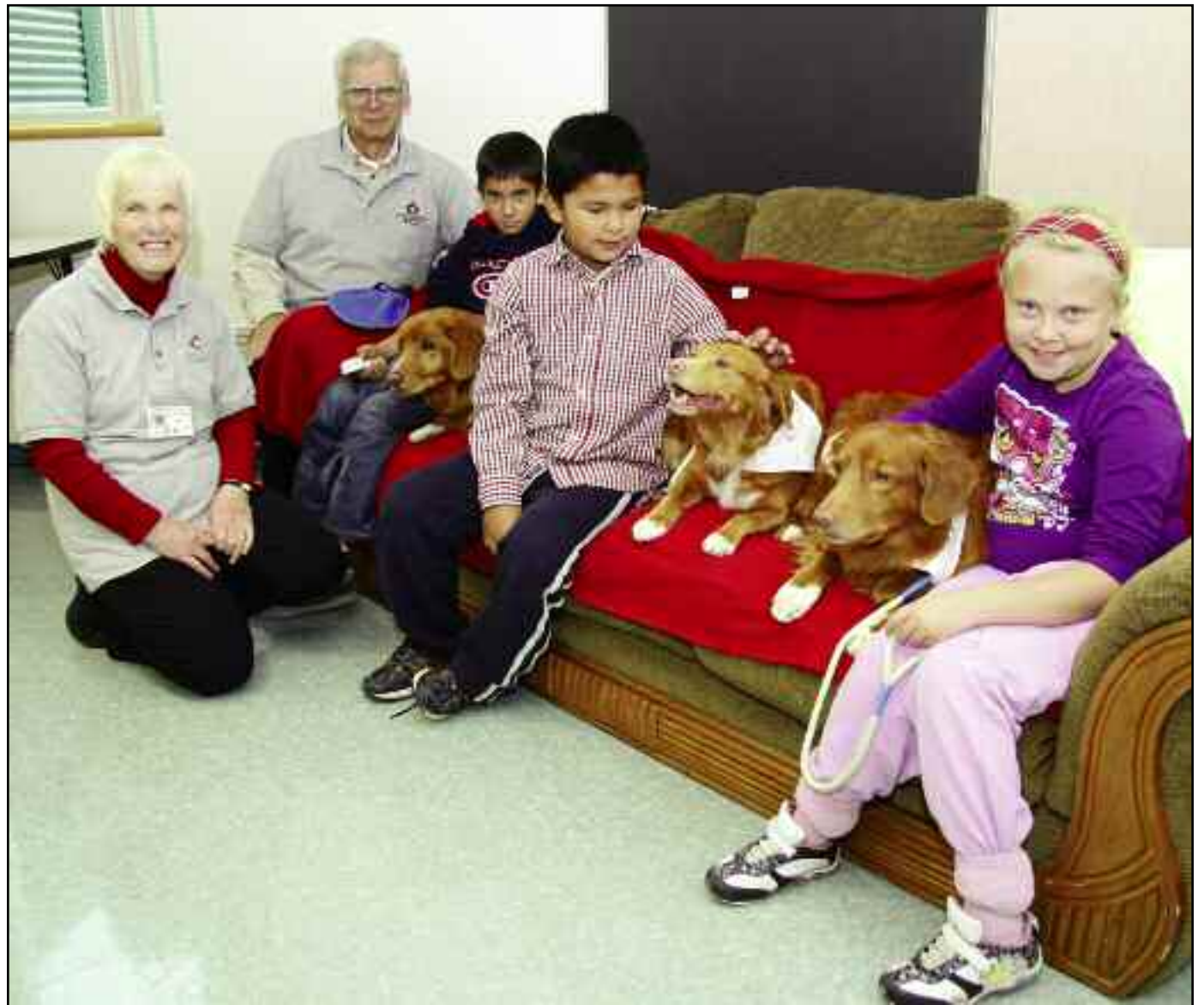
The canine PALS with Greenway students.