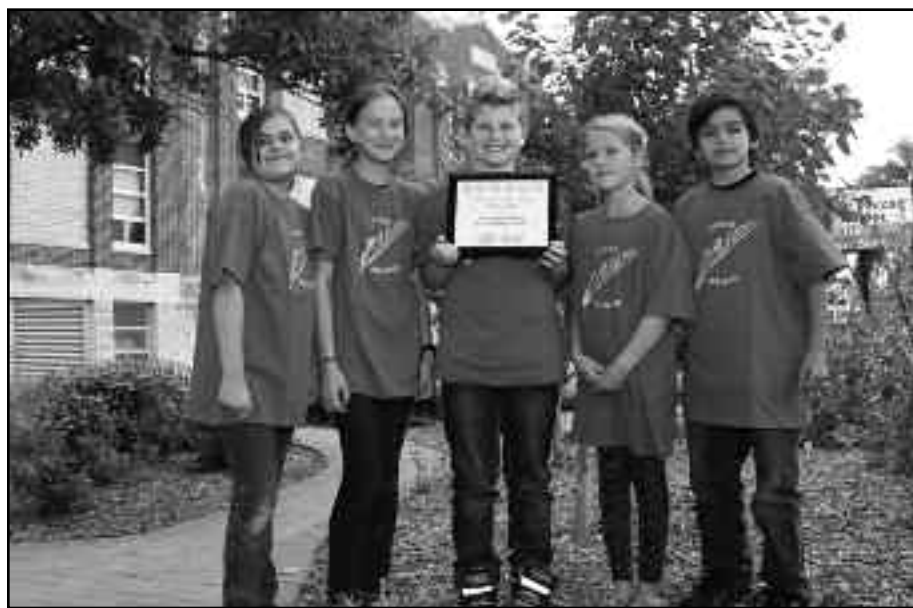
Lord Nelson students in the school's award-winning garden.

Lord Nelson School's gardening efforts recently drew the attention of judges in Take Pride Winnipeg's 2012 Winnipeg In Bloom contest.