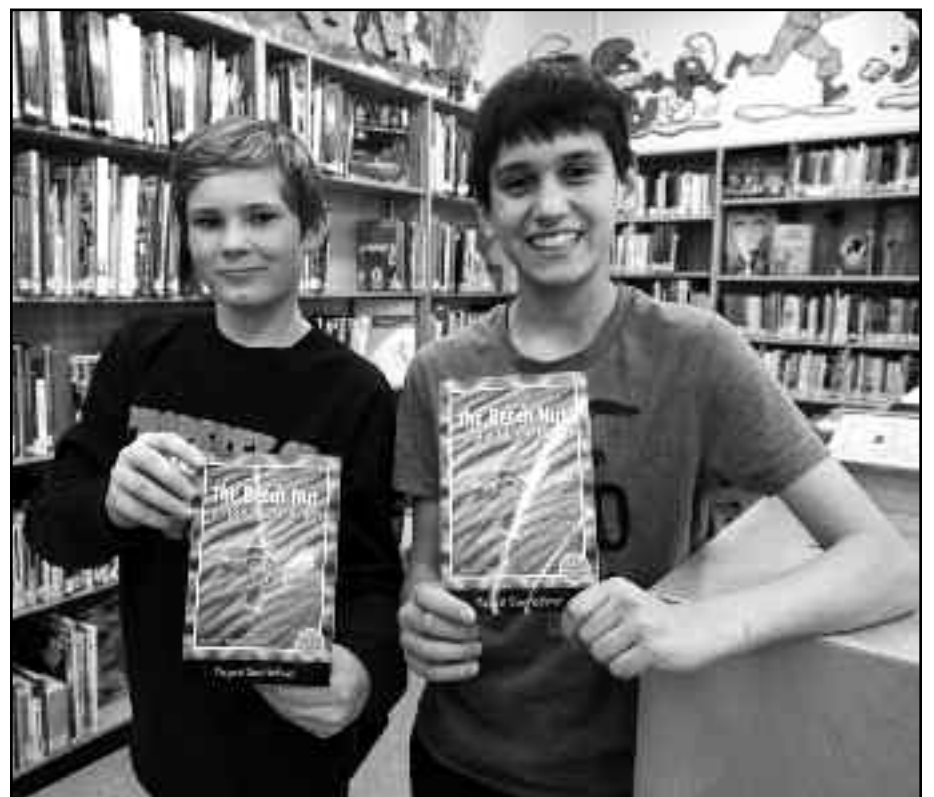
Students with copies of The Beech Nut of Big Water Beach .

Both students said they enjoyed listening to the author read from her novel.