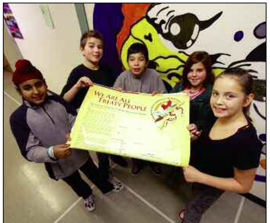
"We are all treaty people"