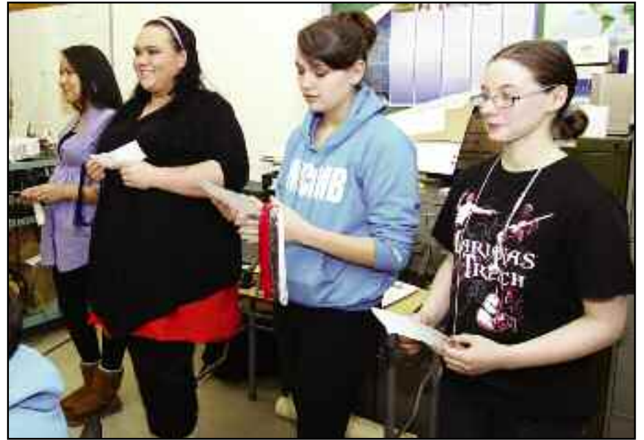
Elmwood students discuss Elmwood's Aboriginal Youth Leaders group with junior high students at the school.

The leadership students have recently made connections with the community organization Restoring the Sacred; the students have been hired to serve as mentors to new students outside of Elmwood and the Division.