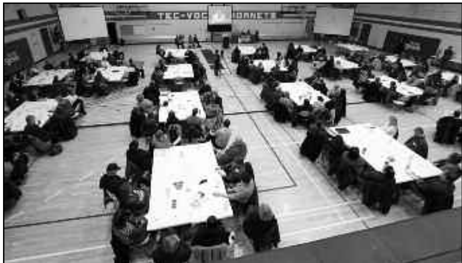
A delegation of parents, school administrators, trustees and educators met at Tec Voc High School for the Nov. 29 Parent Information Evening.

The Division's Board of Trustees met with parent councils, educators and administrators from across the Division for a special Parent Information Night held at Tec Voc High School on Nov. 29.