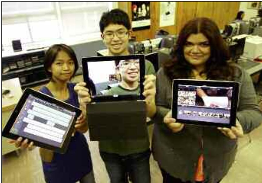
Sisler Digital Voices students. The program is exploring the positive ways in which mobile technology can be used to educate and share ideas with students elsewhere in Canada and the United States.

Sisler High School's Digital Voices program—a web design and rich media program that is building far-spanning technology partnerships with other North American schools—was recently honoured as one of the three international finalists for the Adobe Educators' Choice Award.