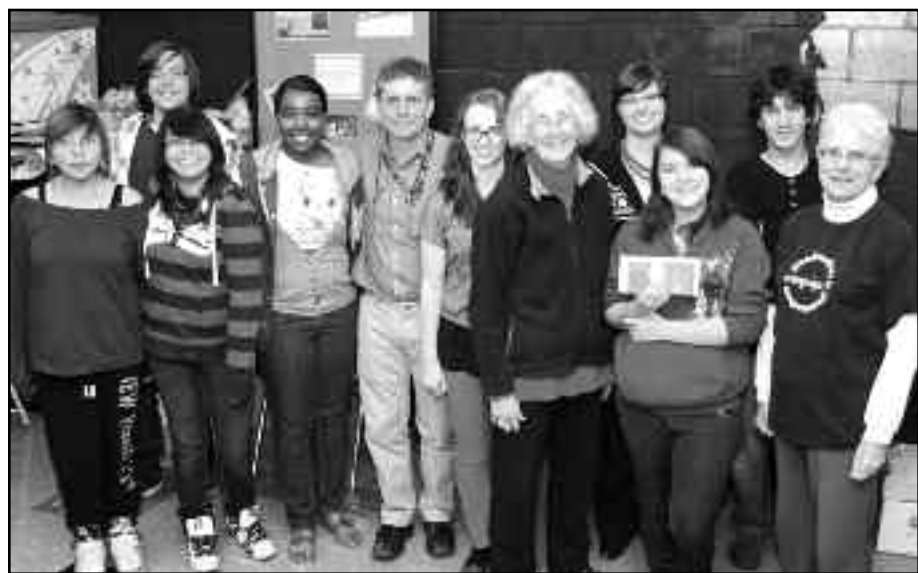
Sisler’s Community Action Committee presents $500 for AIDS support projects to Grands ‘N’ More.

Sargent Park athletes thanked NBA Cares for the gifts and said they looked forward to continuing to pursue athletic excellence.