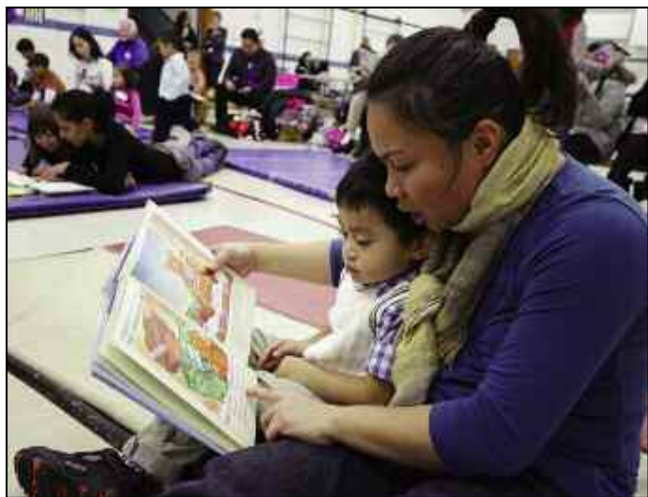
A parent and her son read a book together at the Teddy Bear Picnic reading party.