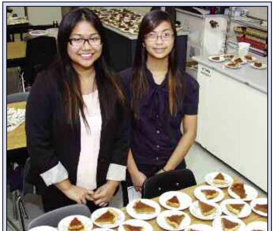
The dessert course behind-the-scenes.

"Kids are kids. It's just natural for them to be moving."