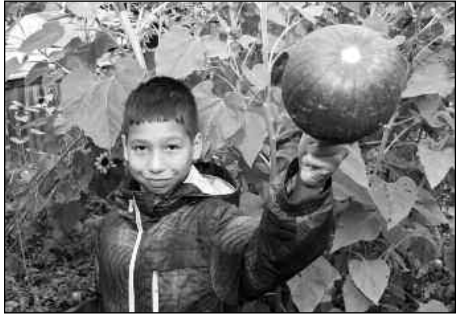
One of the gourds harvested in the Burrows community garden.