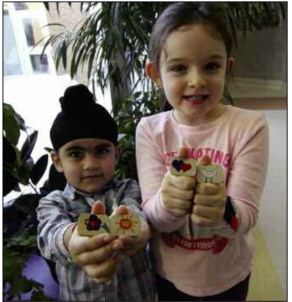
After learning more about the residential school system and its impact on Aboriginal people in Canada, students will create colourful tiles in honour of the victims and survivors.