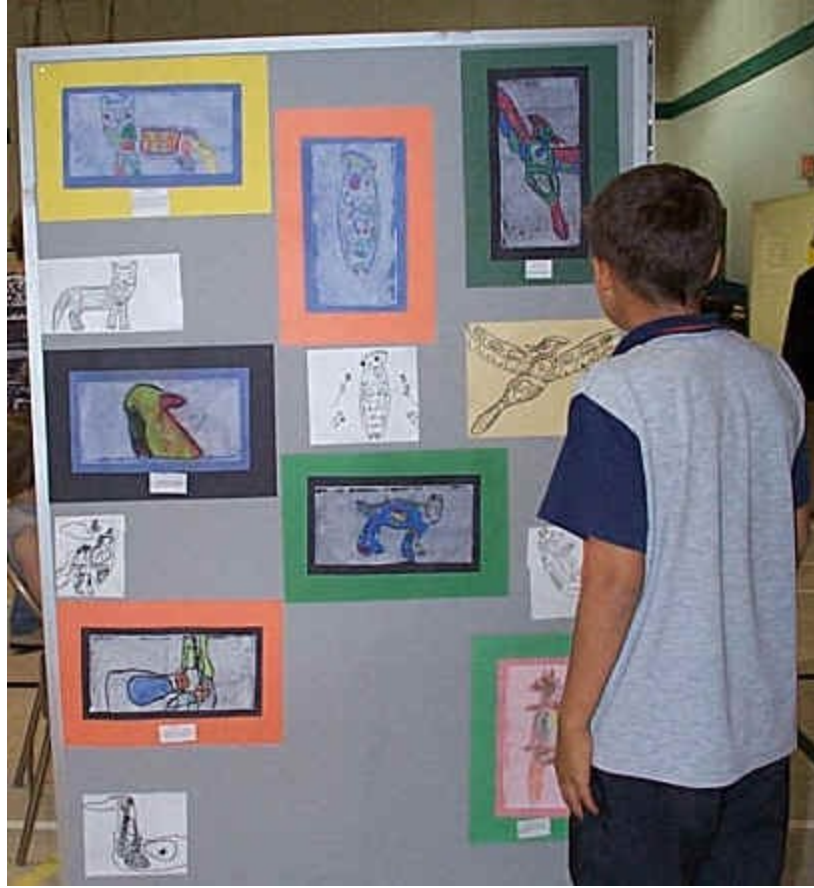
Viewing the completed prints by Room 16