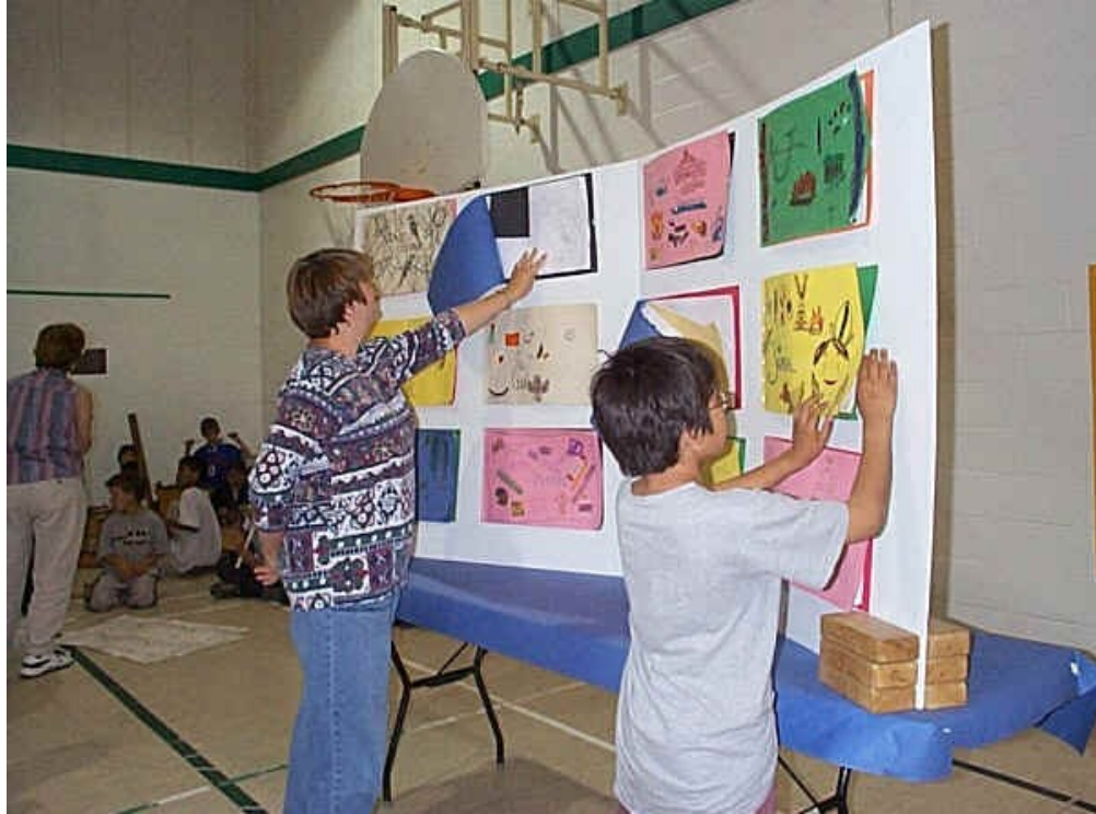
Examining Art Journals by Room 18