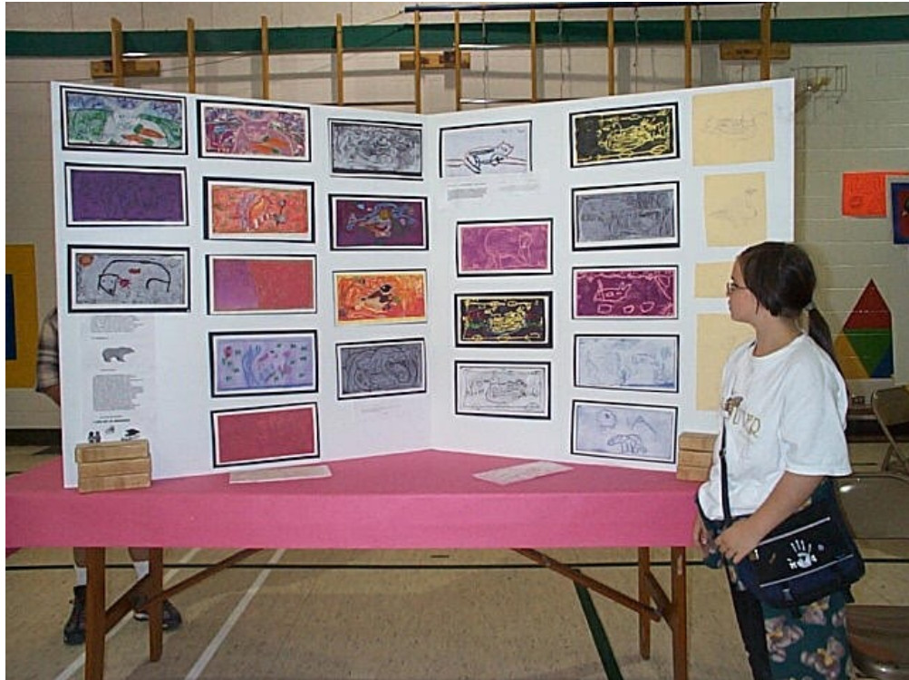
Prints from Room 18