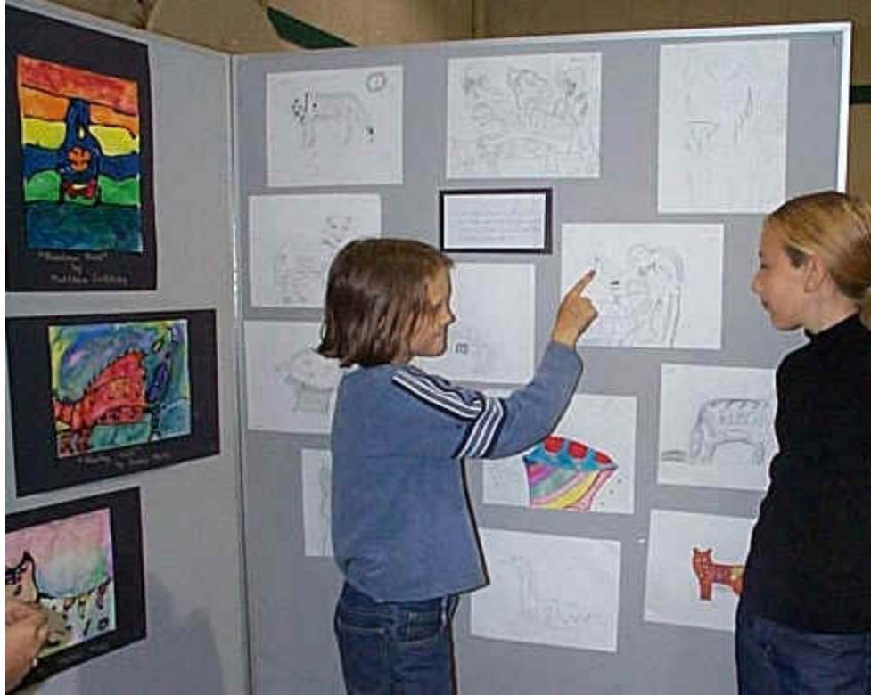
Sketches and Watercolours, Room 17