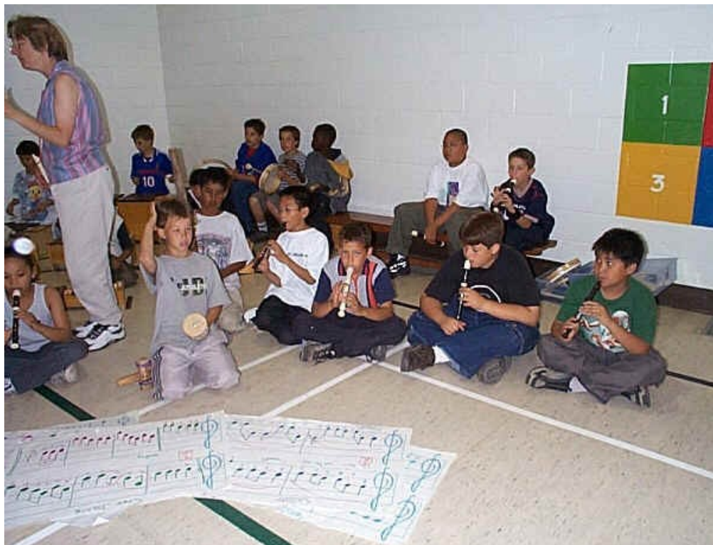
The musicians provide the right atmosphere.