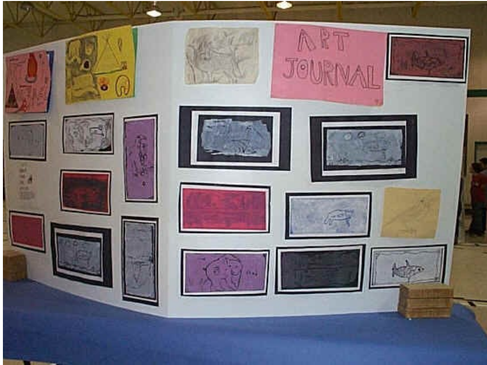
Sketches and Prints from Room 18