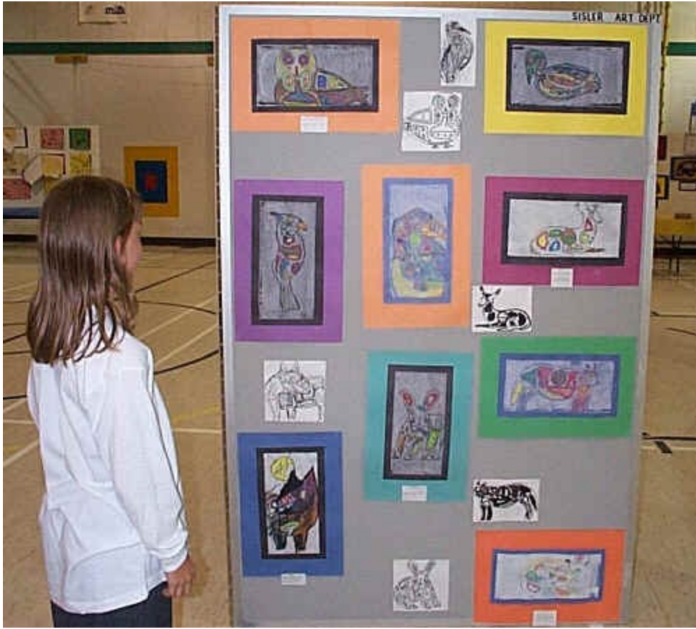
Prints and sketches, Room 16