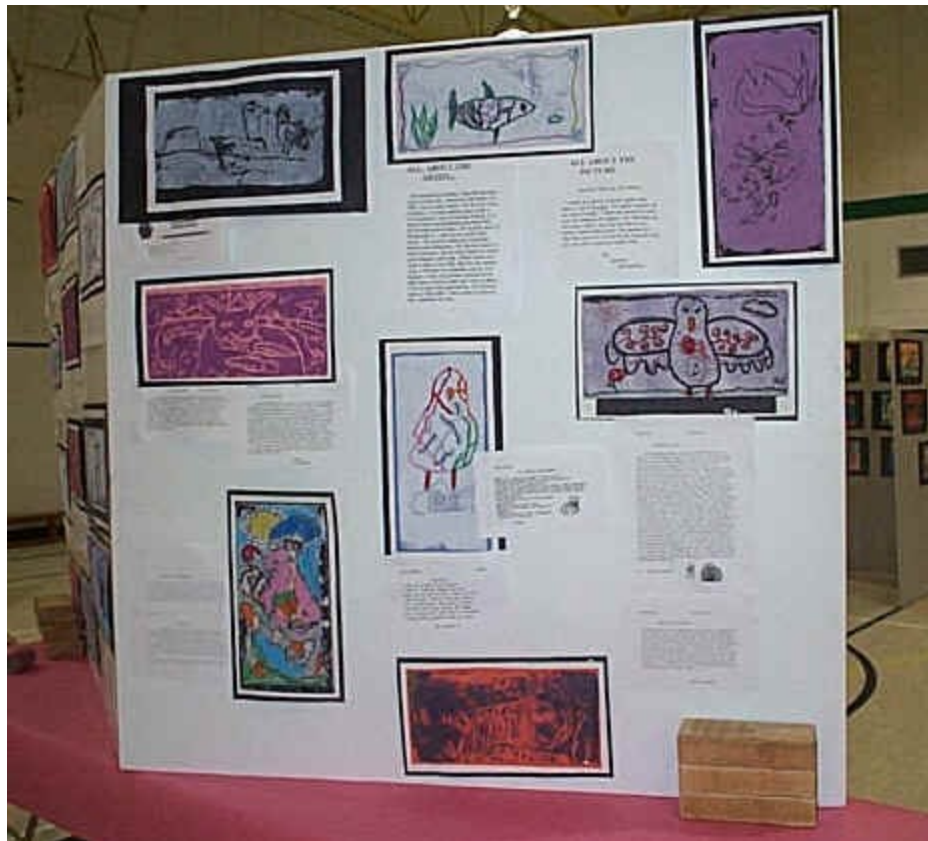
Prints by Room 18