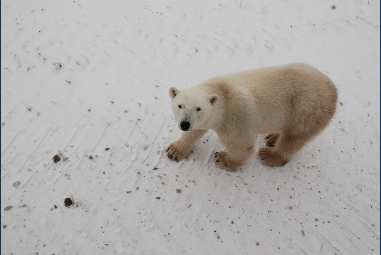
DENVER THE POLAR BEAR