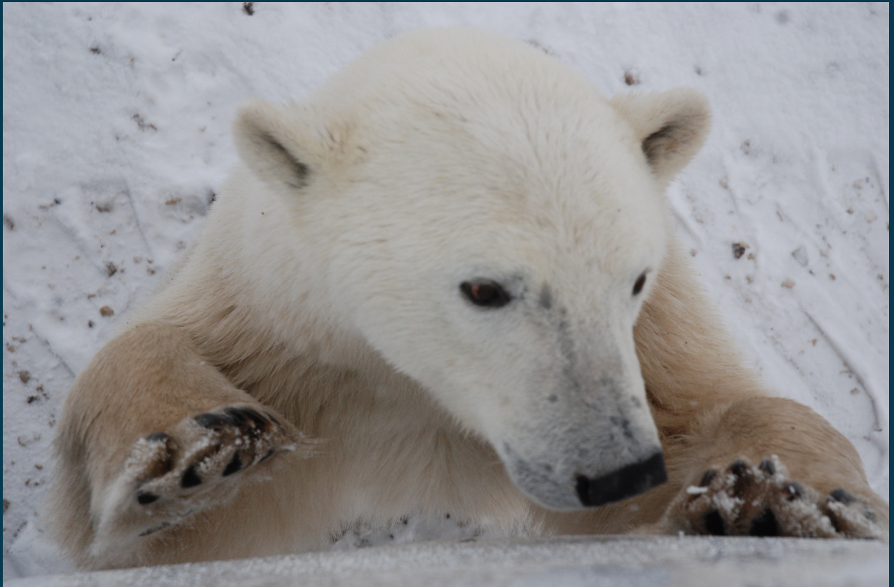
WINNIPEG THE POLAR BEAR GETTING UP CLOSE AND PERSONAL