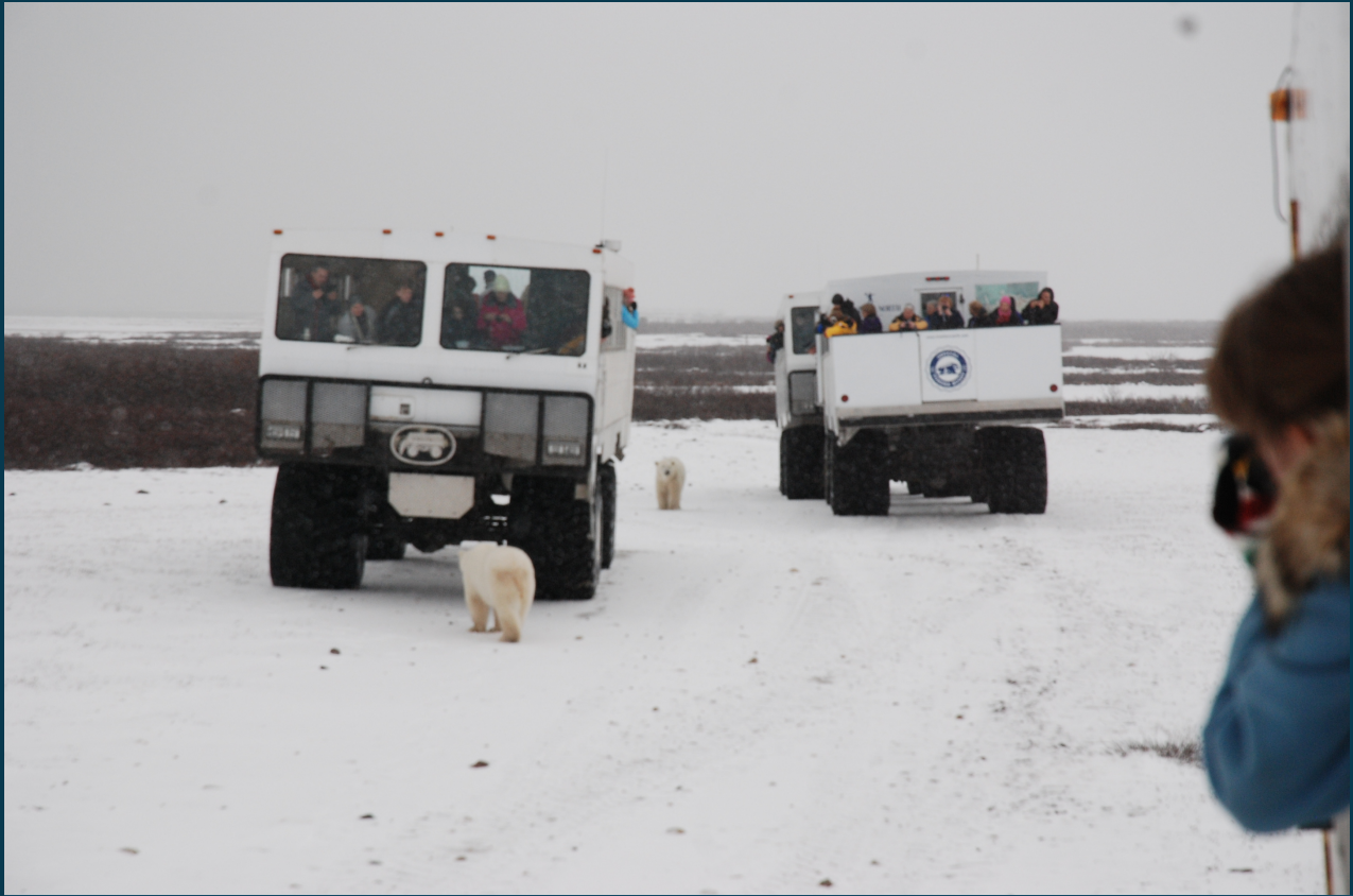
COLLECTING DATA ON THE TUNDRA BUGGIES