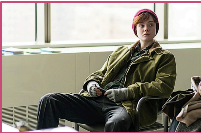
Elle Fanning as Ray in About Ray

The concept of “taking whatever you can get” is familiar to many people in the LGBT community in regards to representation in the mainstream media, but it is one that has been challenged recently. The not so recent phenomenon of casting cisgender (which just means non-trans) actors in transgender roles has become extremely prevalent now that more movies about