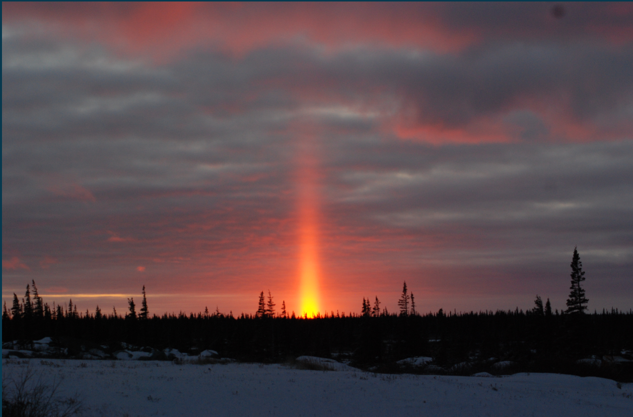
SUNSET ON THE TUNDRA